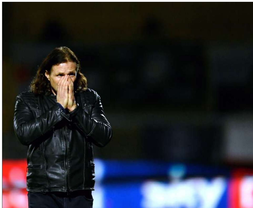
Wycombe Wanderers boss Gareth Ainsworth admitted that his side were not good enough in the opening half, but made up for it with a stunning second half comeback, to make it six home wins in a row

It was a brilliant display from Ainsworth's men as they move up to fifth in the table.