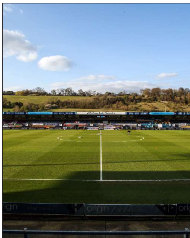
Adams Park has been the home of Wycombe Wanderers since 1990 after they left Loakes Park

FOURFOURTWO magazine have named Adams Park in their list of the 100 greatest grounds in Britain.