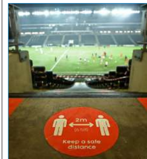
Stadium: MK

WYCOMBE Wanderers manager Gareth Ainsworth has praised the Chairboys' fans commitment following their 2-1 loss against MK Dons in the Papa John's Trophy.