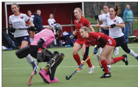
It was an entertaining game against Amersham last weekend

Other women's results 3rd team beat Milton Keynes 2 2-0 away. 5s beat Newbury & Thatcham 4 3-0, 6s lost 5-0 to Newbury & Thatcham 3 5-0 away, 7s lost 5-1 to Reading 7