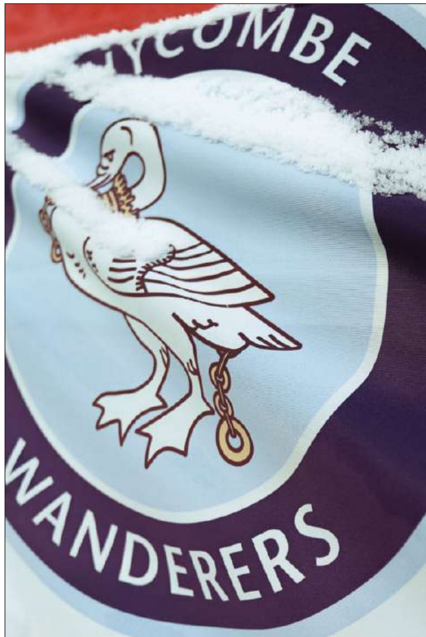
Wanderers tasted defeated on the road as they lost to Eastleigh (PA)

The Chairgirls are back in action at Burnham next Sunday, as they are set to face Eastleigh on the double, but this time in the League Cup where they look to progress to the next round of the competition.