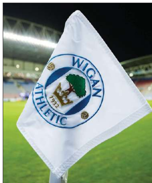
It was a late defeat at the DW as Wycombe made it one win in 16 league matches (PA)

The result also ended Wanderers' unbeaten start to 2024, whilst also making it just one league victory in 16 league games.