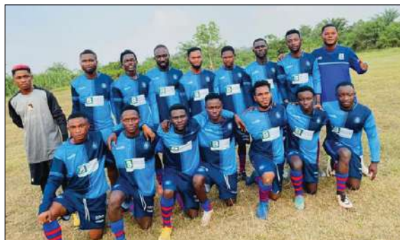
The kits are now in Ghana following a recent donation

NUMEROUS kits that were used by the Wycombe Wanderers Women's team have found themselves a new home in Africa.