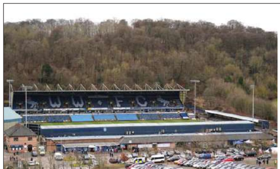
The red card was Wycombe's first at Adams Park (pictured) since April 10, 2021 - a run that lasted nearly three years