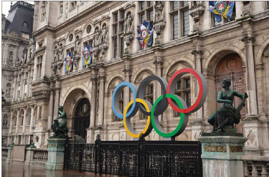
The Olympics will take place in France this summer

These aren't just words - it's working. European silver in the summer was England's best result in 14 years and only the third time they'd