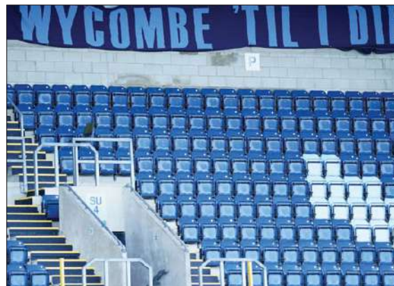
It has been a mixed season for Wycombe Women so far

Kick off is at 2pm. Wycombe's first home game of 2024 will see them host Woodley at the 1878 Stadium.