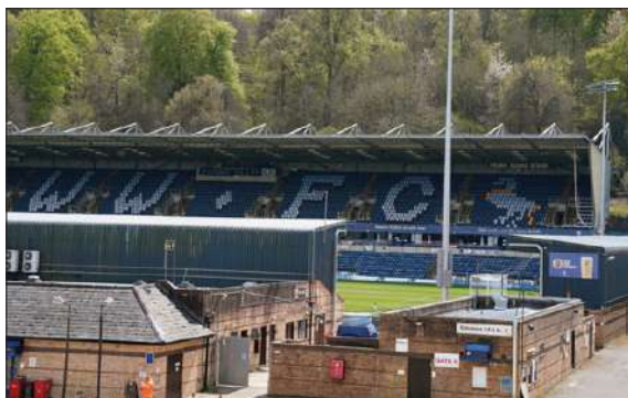
The 20-year-old only played nine times for the Chairboys