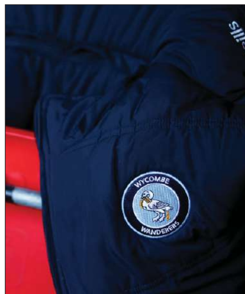
The win was Wycombe's first in the league since October 7, and their first at home since September 30