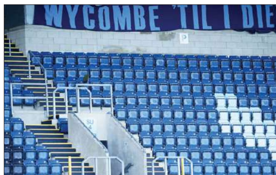
The boss was not happy with his team's defending