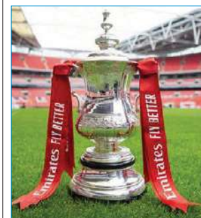
Focus on the FA Cup (PA)

WYCOMBE'S mid-season crisis continues with just one win in their last nine league games, and from being play-off contenders a few weeks ago they are now dangerously close to the relegation places.