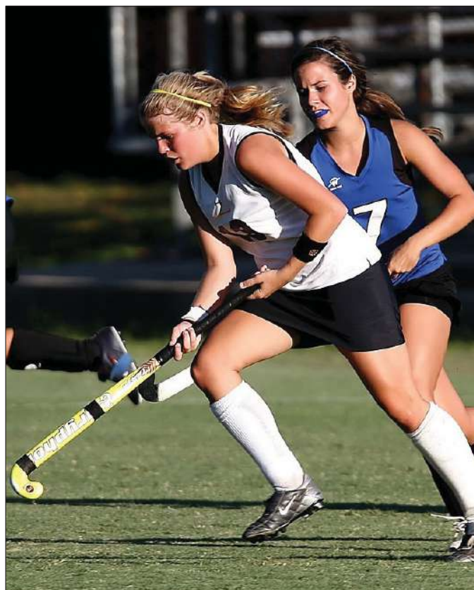
It was another victory for the women's team

MARLOW dominated the game from the start but found it not easy to create too many clear-cut chances against a massed defence.