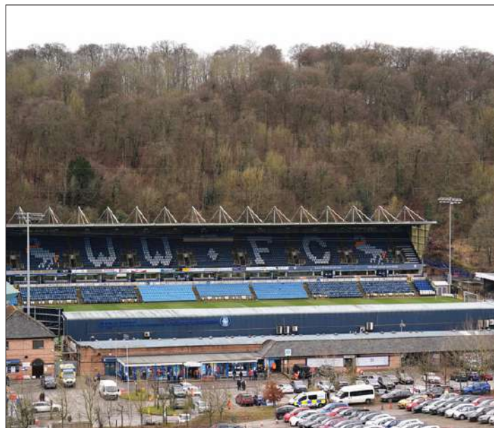
This weekend's match against Stevenage is Wycombe's first at home on a Saturday since September 30

However, Saturday's encounter provides the perfect opportunity for the Chairboys to prove they have what it takes to become play-off contenders this season.