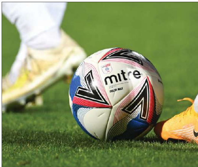
Wycombe Wanderers Women defeated Eastleigh 3-2 to get back to winning ways

LOCAL people came out in force to cheer on Chesham United in the first round of the FA Cup.