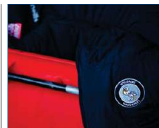
It was on another away day