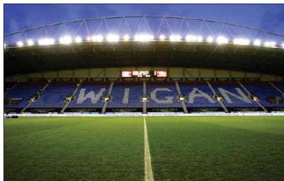
Wycombe's match against Wigan has been called off