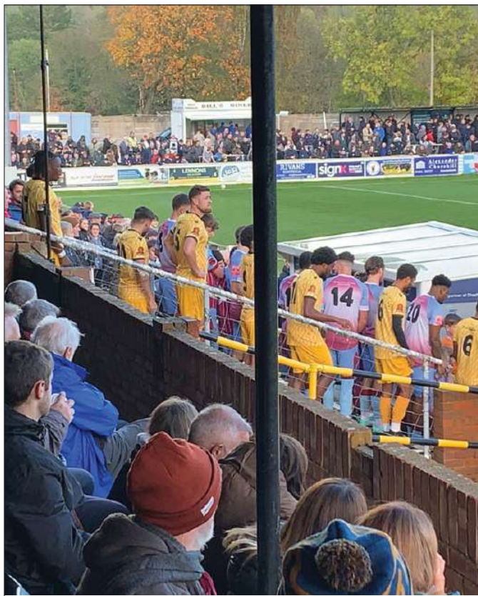
Chesham would lose 2-0 at home to Maidstone in the FA Cup, with nearly 3,000 people present at the fixture