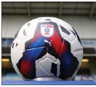
Wycombe sit in 8th

"But that's football and I felt really good getting my first start at Cambridge since returning, and hopefully we will have a good run in for the last three games."