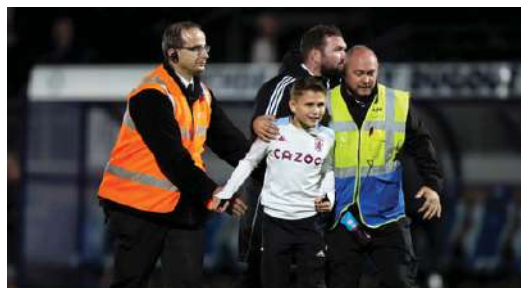
A young Villa fan is escorted off the Adams Park turf. He'll have a story to tell when he's older .