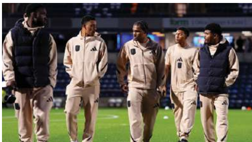
Despite the rotation, several of the Villa players have played in the Champions League this season