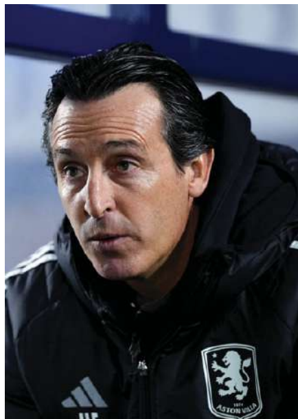
The former Arsenal and PSG manager made 10 changes to his side for their trip to Wycombe