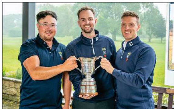
Castle Royle lifted the cup.

Jack Edwards of Shifnal Golf Club (Shropshire) had the best round of the day, shooting a 32, including an eagle and three birdies.