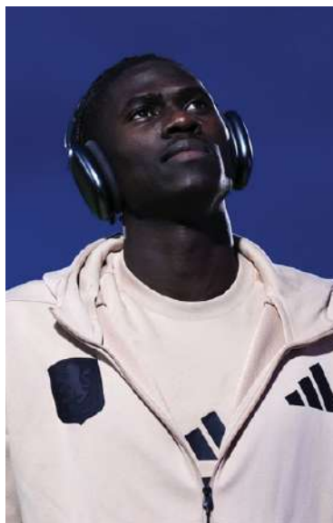
Amadou Onana takes in his surroundings on Tuesday night in South Bucks