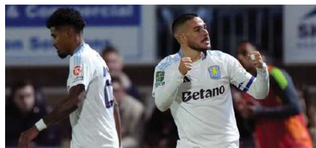
Buendia celebrates his goal in front of the Villa fans as his header gave the Premier League side the lead in the early stages of the second half.