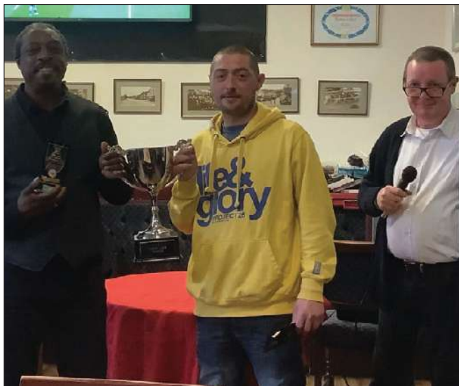
The trophies were handed to the snooker players following a long four-year wait

Numerous other broadcasters and clubs have paid tribute to Motson, which includes Wycombe Wanderers, who shared the image of him standing at a snow covered Adams Park 32-and-a-bit years ago.