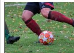
They lost 5-1

WYCOMBE Wanderers Women's first team suffered another defeat as they were thrashed 5-1 away at Eastleigh.