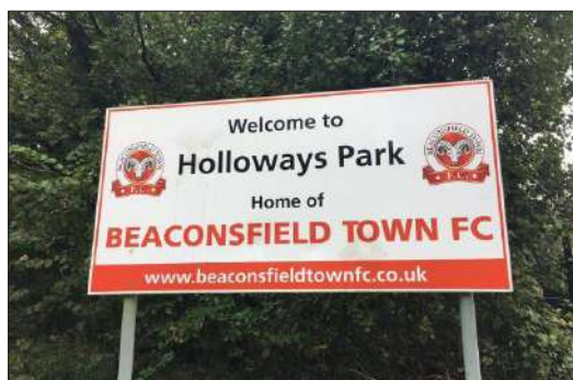
Holloways Park - the home of Beaconsfield Town FC