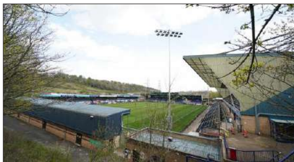
The man ran on the Adams Park pitch

A statement from Wycombe Wanderers read: "An 18 year old has been banned for life from Adams Park after entering the field of play from the terrace and endangering player safety during Saturday's League 1 encounter against Oxford United. The individual had no previous ticket history at the stadium and his behaviour does not reflect the excellent conduct of the club's genuine supporters."