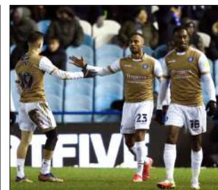
Long range specialists?