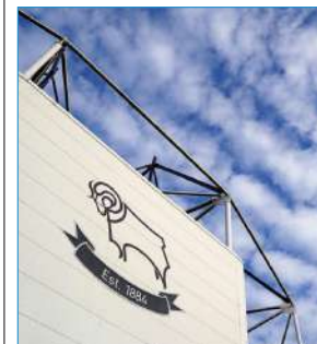
Pride Park

THE EFL has addressed Wycombe Wanderers and Middlesbrough's legal action against Derby County.