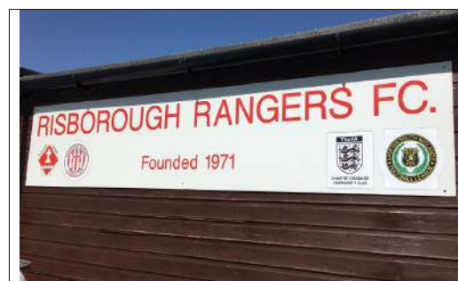
Risborough Rangers play their games at the B.E.P