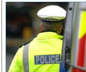
Police arrested a man

A MAN has been arrested after a "substantial" amount of class A drugs were found in High Wycombe.