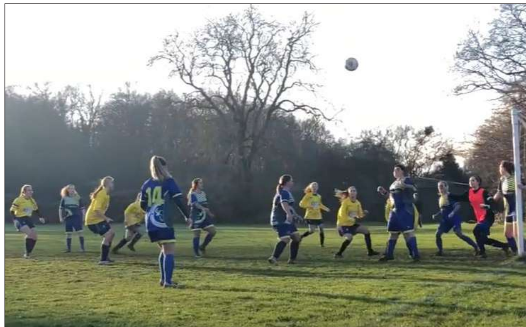
It was a thumping win for the Wycombe Wanderers Women Reserve Team, as they smashed Launton Ladies