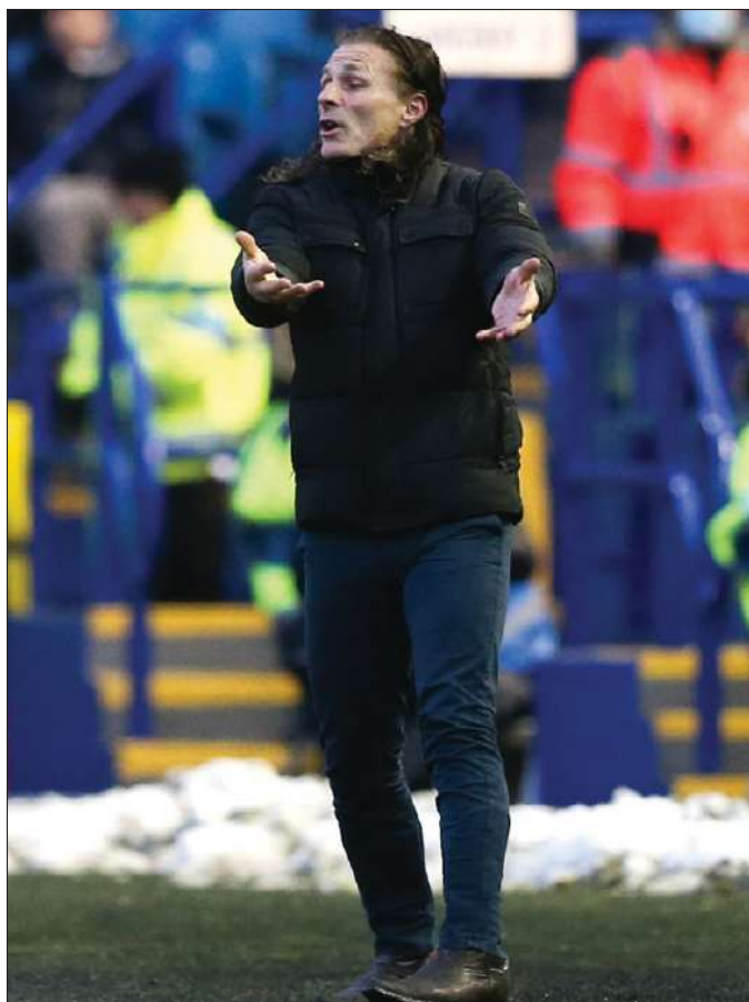
Wanderers have not won in their last four games since October 22 (PA)