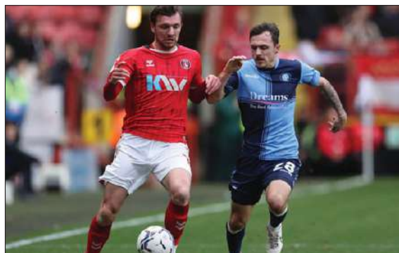
The midfielder hasn't played since September 13 (PA)