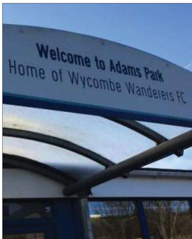
Wycombe have now not won their last five home games, losing two and drawing three since they defeated Peterborough 3-1 on October 15

WYCOMBE Wanderers have been eliminated from the FA Cup in the first round after falling to a 2-0 home defeat against League Two Walsall.