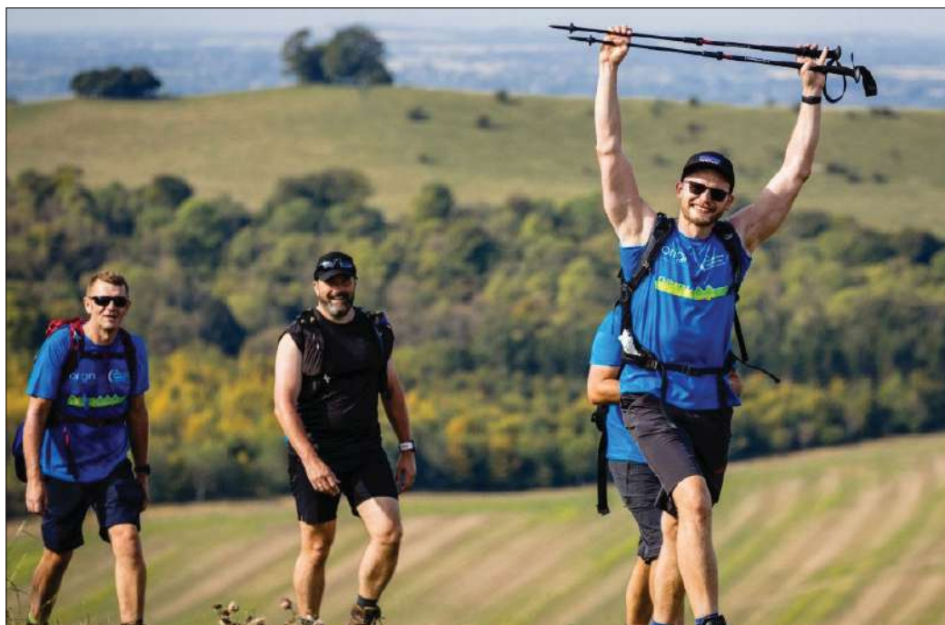
The event will take place on September 8.

"To achieve this, we need the continued support of our local communities. Whether you have a personal connection to the cause or are looking for a physical challenge, this