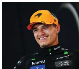
Lando Norris finished second

A poor strategy call scuppered Norris' hopes of winning in Canada earlier this month before the Briton said his start in Sunday's race in Spain – where he dropped from first to third – denied him another triumph. Verstappen