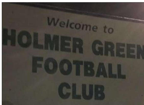
Holmer Green had a very difficult 2023/24 season

Finally, Windsor & Eton FC of the Thames Valley Premier League, who now play at Stag Meadow along with Virginia Water FC, also finished third. In their case a few points behind Westwood Wanderers FC and Wargrave FC, suffering from not turning draws into wins.