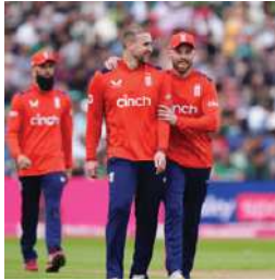
England's Liam Livingstone (left) with Phil Salt (right)

LIAM Livingstone says England are ready to peak at the perfect moment after a rollercoaster ride to the semi-finals of the T20 World Cup.