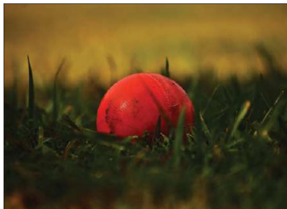
Bucks defeated Berks last weekend.