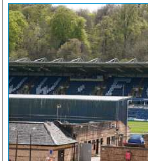
Can Wycombe win again

WYCOMBE fans are used to their team doing things the hard way, so it was no surprise that their first win of the new league season saw a nail-biting finish as 10-man Leyton Orient almost snatched a draw at Adams Park in midweek.