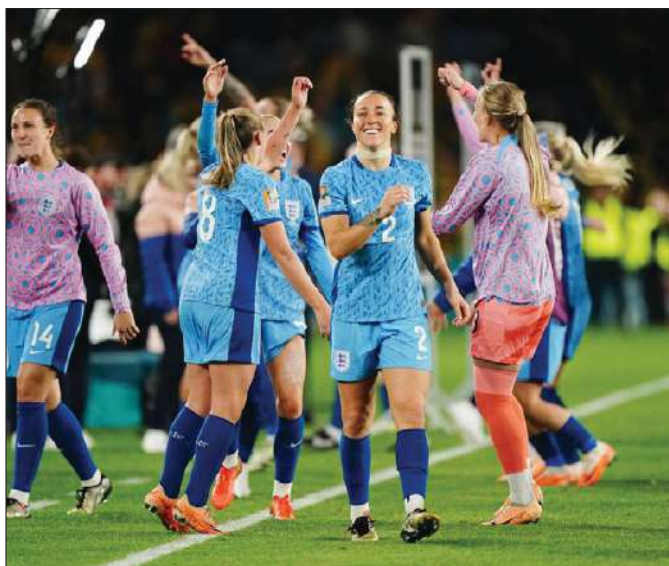
England's Lucy Bronze celebrates after the semi-final match in Sydney

"I played Road to Wimbledon when I was much younger and I'm still friends with some of the people that I played against."