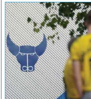
The Kassam Stadium

FOOTBALL is a game of opinions, but there is a saying which perfectly describes today's keyboard critics: 'What a pity all the people who know how best to manage football teams are busy doing other jobs or sitting on their sofas!'