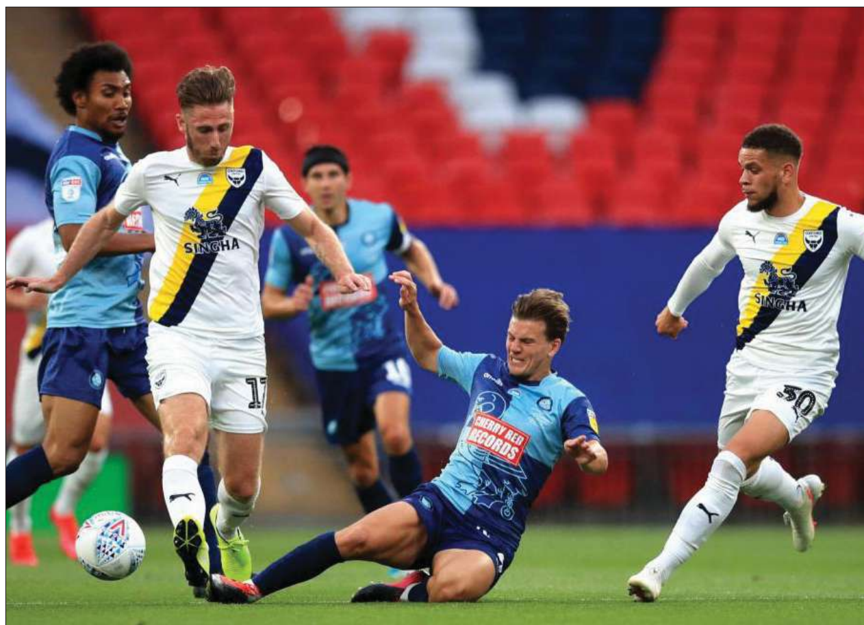
Wycombe Wanderers' 2-1 win over Oxford United in July 2020 secured the club their place in the Championship for the first time