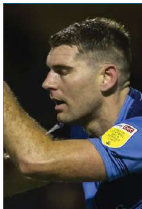
It wasn't Wanderers day