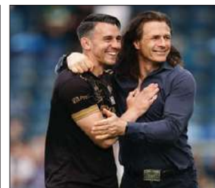
Bloomfield and Ainsworth (PA)

Wycombe are expected to sell out their allocation at the Kassam Stadium.