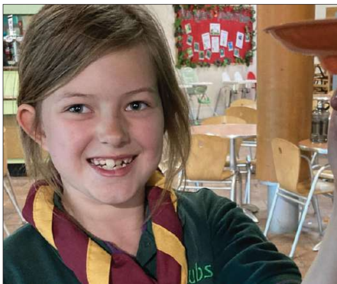
The event saw hundreds of children from Buckinghamshire attend

All funds raised on the day are donated to Myocarditis UK – a charity dedicated to researching the causes, prevention, and cures of this life-threatening heart condition. To donate and to find out more about Myocarditis UK, please visit www.myocarditisuk.com where you can also discover the full events list for 2023.