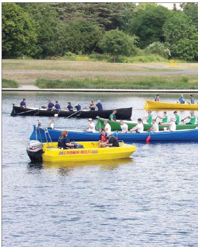
The event took place on June 14 with Blaser Mills coming out on top in Berkshire

BLASER Mills Law in Buckinghamshire set the fastest time at this year's Jansons Rowing Cup competition, where they secured first place.