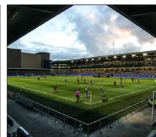
Plough Lane