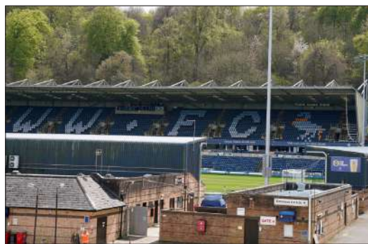
Both days will be busy at Adams Park

With the Blues out of the play-offs by just three points, their double header of games this weekend against Binfield then Thatcham will be crucial.