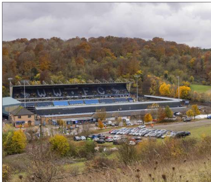
Where do Wycombe rank in the table in terms of how cheap a day out at Adams Park is amongst the other League One teams?