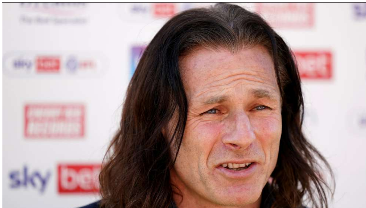
Wycombe boss Gareth Ainsworth has confirmed that regardless of what league Wanderers are in next season, they are currently 'preparing as a Championship club'. The players returned for pre-season training on July 1 and have friendly matches during the next four weeks