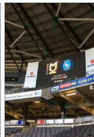
Wycombe will play MK Dons

Wycombe will start their season against Accrington Stanley on August 7 at Adams Park.