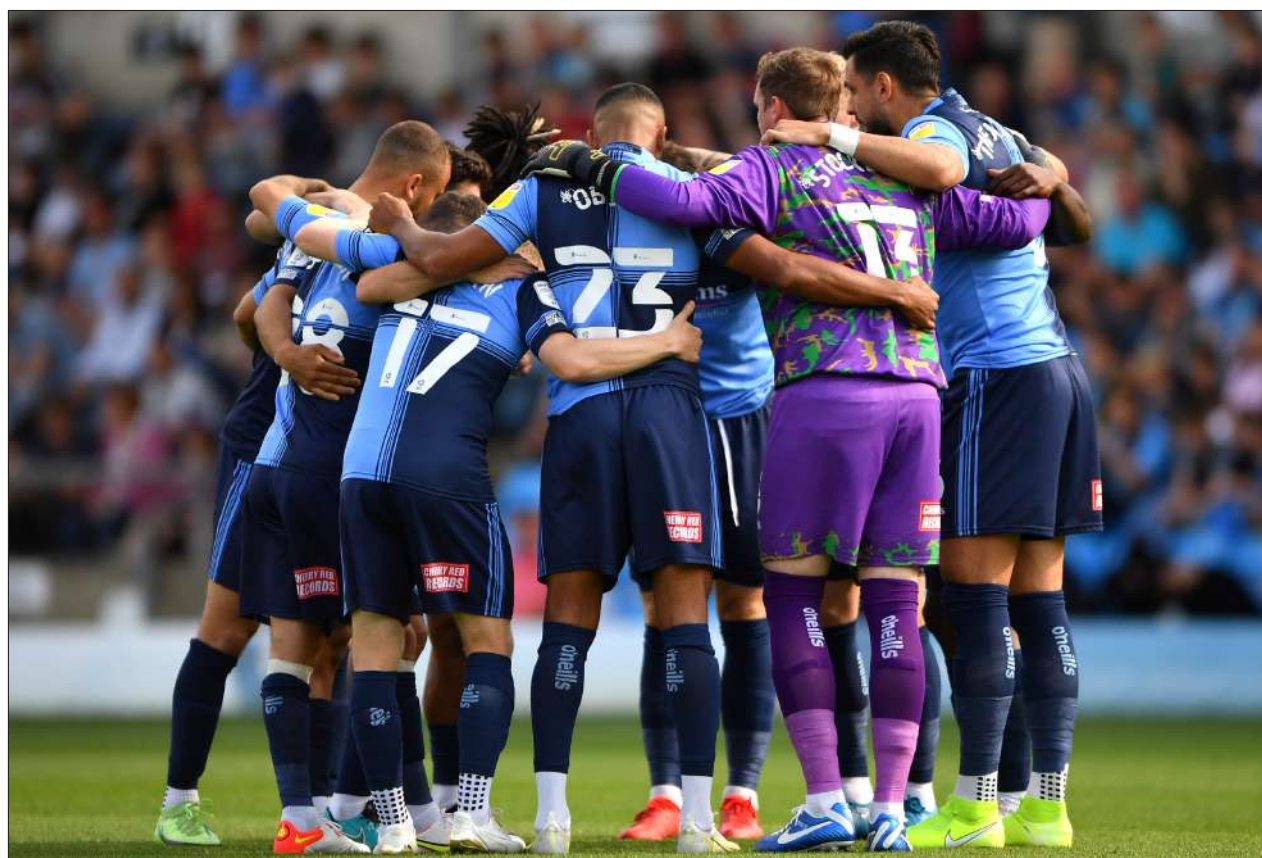
The win over Burton means Wanderers have picked up 10 points from their last 12 available. Up next for the Chairboys is AFC Wimbledon