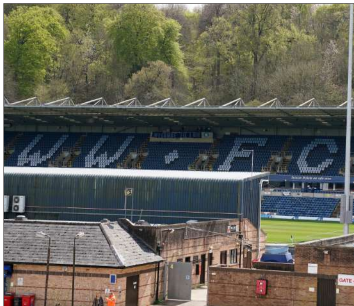
The kit was released just before Wycombe Wanderers took on Burton Albion at Adams Park on Tuesday, December 7

A spokesperson for the club said: "The club has always strived to be an inclusive and welcoming place, with the newly formed All Quarters Club aiming to enhance that further. The All Quarters project is a consultative fan group that seeks to gather views on how the club can move forward in its inclusivity, with input from four traditionally under-represented groups; those with disabilities, people from minority ethnicity backgrounds, women & girls, and those from the LGBTQI+ community."