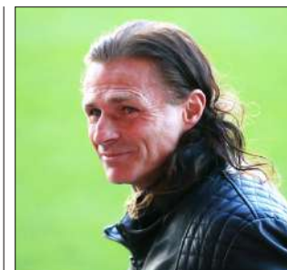
Gareth Ainsworth