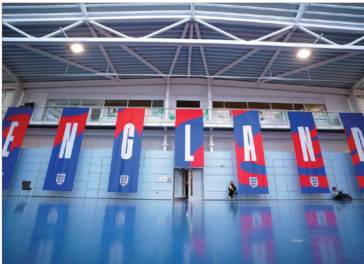
Wycombe Wanderers will spend some days at St George's Park in Burton-up-Trent, the venue where the England players train

To apply, please fill out the application form on their website.