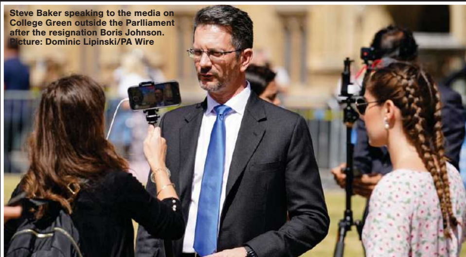
Steve Baker speaking to the media on College Green outside the Parliament after the resignation of Boris Johnson.

Wycombe MP in spotlight as he says he is seriously considering throwing his hat in the ring for the Tory leadership after Boris Johnson's forced resignation, Page 9