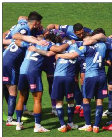
Higher crowds are expected at Adams Park this season