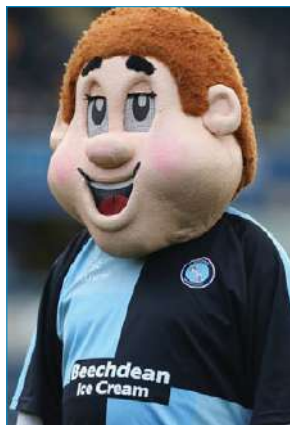
Bodger in the 2014/15 season

WYCOMBE Wanderers have made an appearance in a betting company's list of the most 'bizarre and hilarious' mascots around the footballing world.