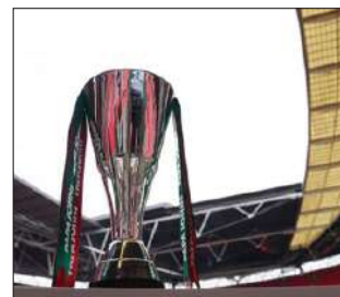
Three games will be played (PA)