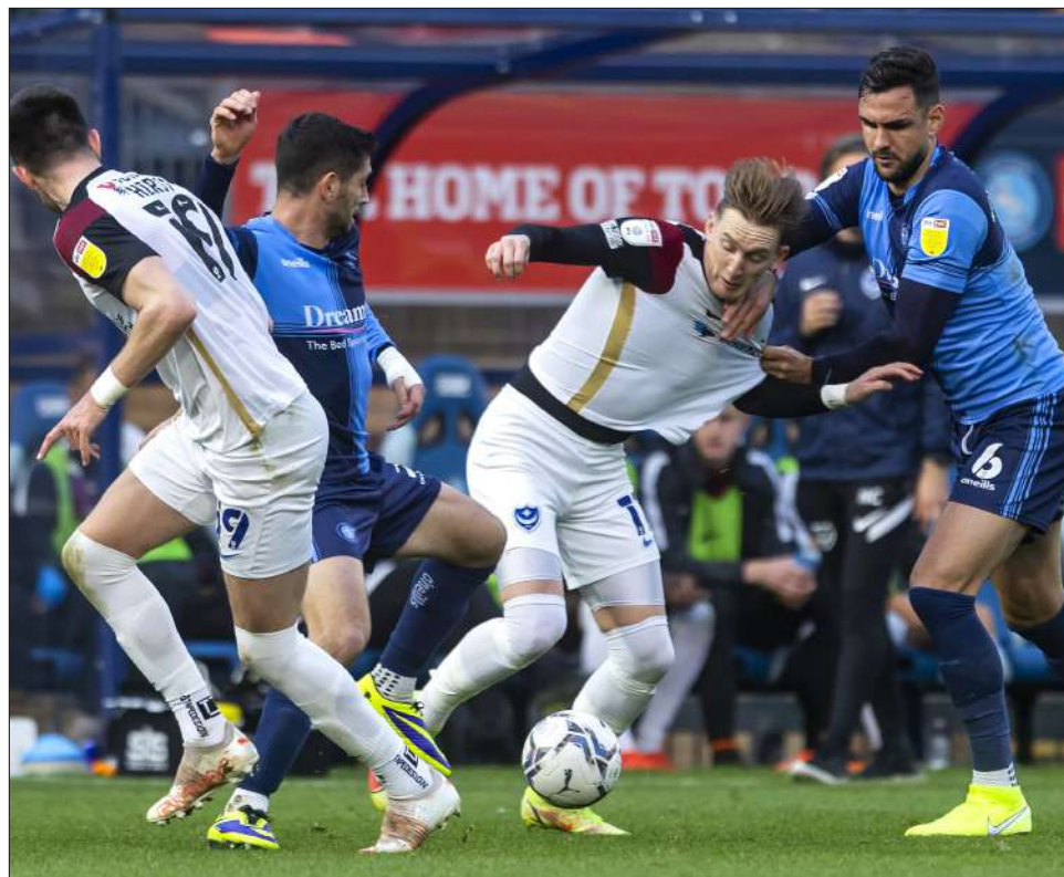
Another clean sheet for the Wanderers as Wycombe draw 0-0 away at Portsmouth

Sam Vokes managed to brilliant go around the committed Bazunu and