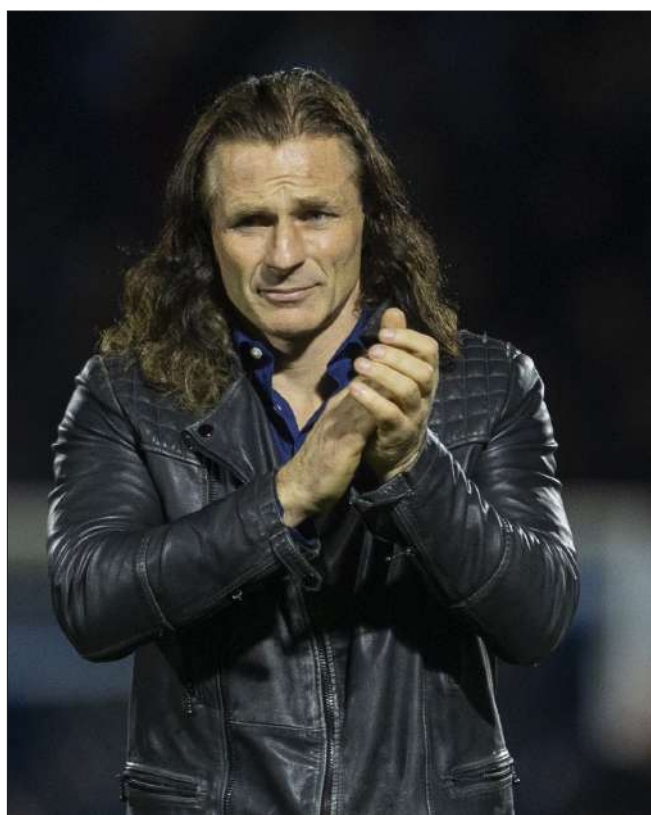
Wycombe Wanderers manager Gareth Ainsworth believes the point could go a long way to help Wanderers' promotion push

GARETH Ainsworth believes if Wycombe were to get promoted back to the Championship at the first attempt, the achievement could eclipse the club's successes from two years ago.