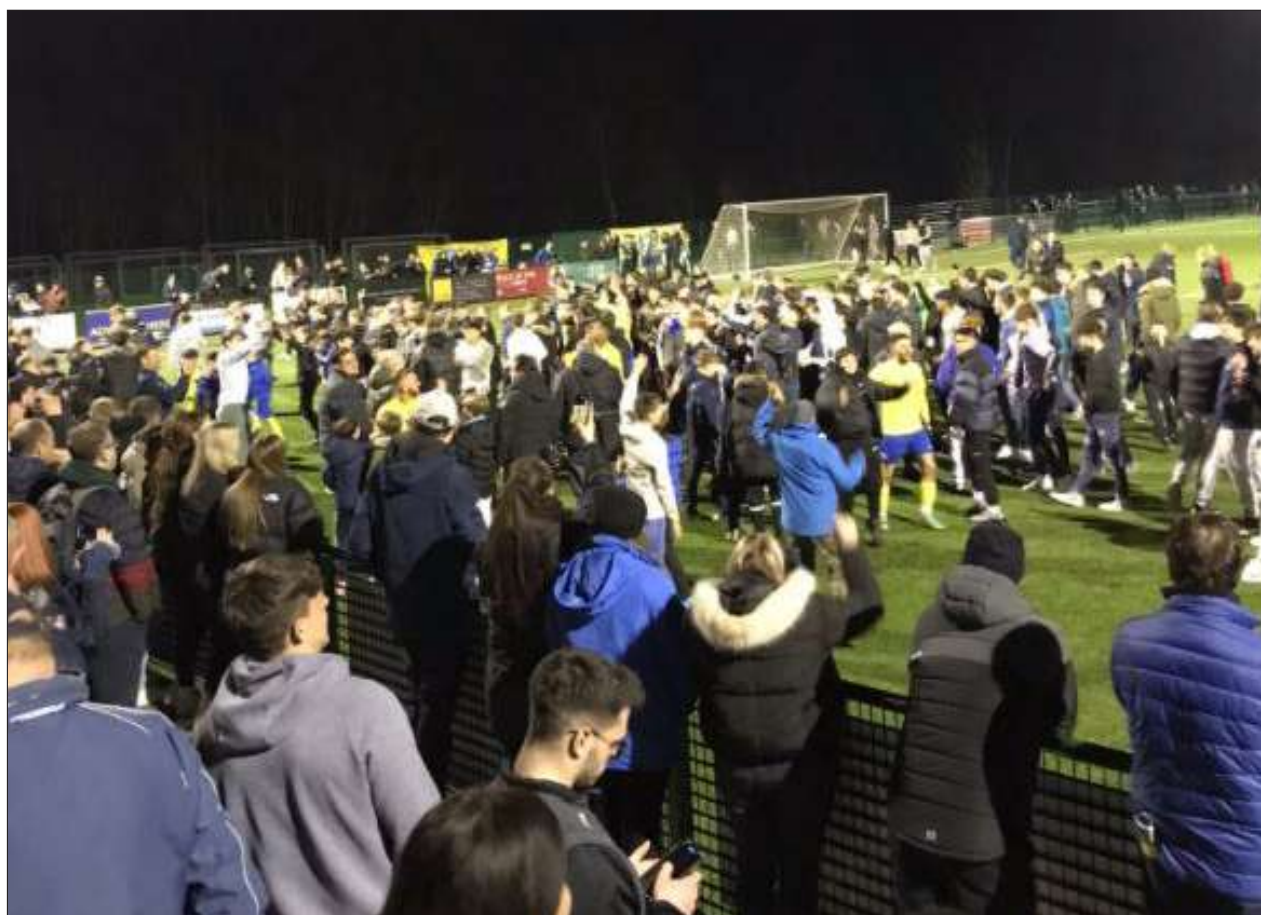
Fans ran onto the pitch after Ascot defeated Wycombe on penalties to reach the Berks & Bucks Cup final