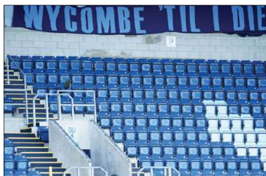
Wycombe Wanderers Women's U18s lost Fulham