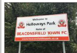
The club play their home games at Holloways Park

BEACONSFIELD Town's Under 18s will play Maidstone in the first round of the FA Youth Cup for the first time in their history.