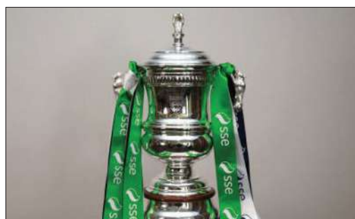
Wycombe's FA Cup dream has come to an end

A sustained period of pressure gave them hope but, just before the break Aylesford scored a fourth goal, seemingly ending the tie.