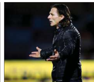
The manager was not happy