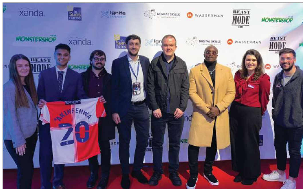
The first screening of the documentary took place on Wednesday, October 26 at the Wycombe Swan Theatre

"At some moments it was very therapeutic to look back and as an individual during my playing career, I was always asked about how many games I've played and