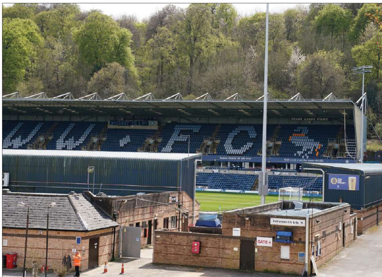
The defeat was Wycombe's second at home against Cambridge since records began. Their last loss against the Us at Adams Park was in