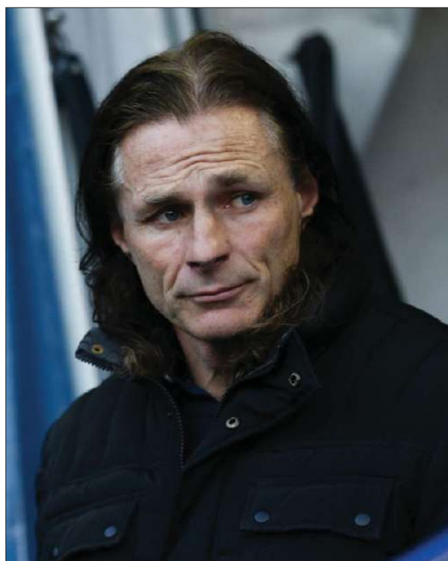
Gareth Ainsworth was not happy with his side's defending as Wycombe lost 3-2 at home against Cambridge

WYCOMBE Wanderers boss Gareth Ainsworth has criticised his side's defending following their shock 3-2 home loss against struggling Cambridge United.