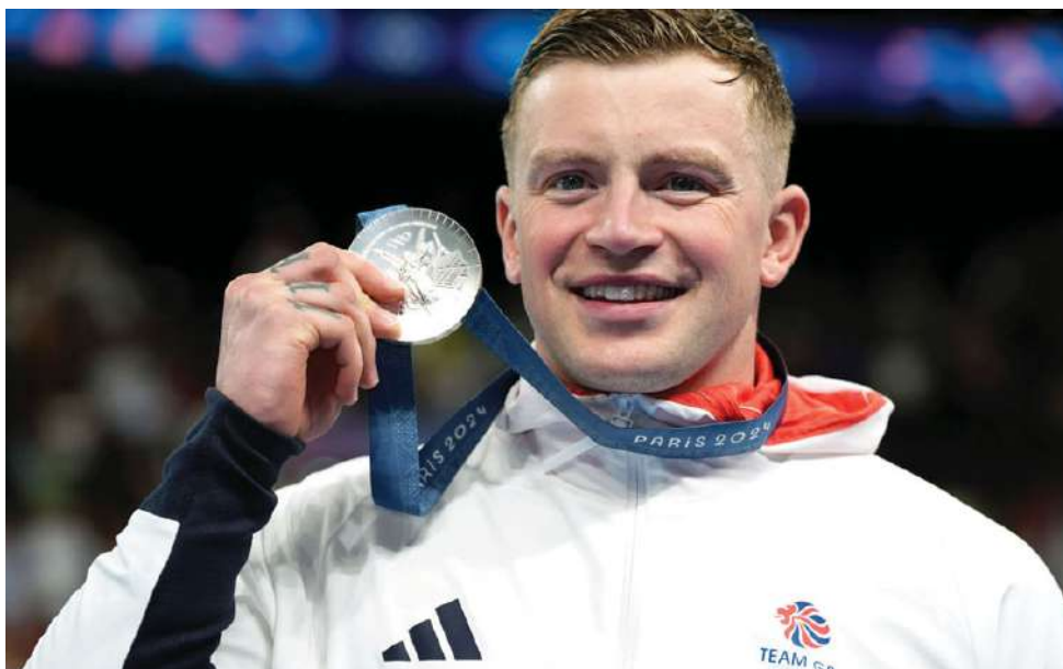
Adam Peaty won Olympic silver in the men's 100 metres breaststroke on Sunday

Just before her 20th birthday she still feels a kinship with the setting and wants to do her best to elevate the competition.