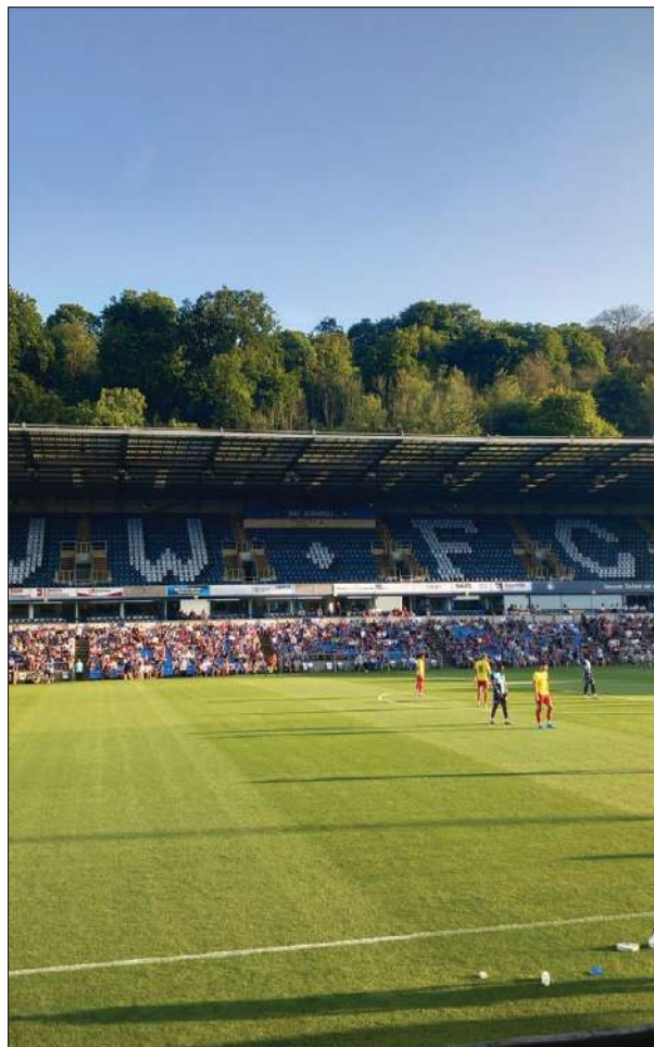
Wycombe's 3-2 win over Watford will be their only pre-season home match this summer

The Chairboys then start the season away at Wrexham on August 10.