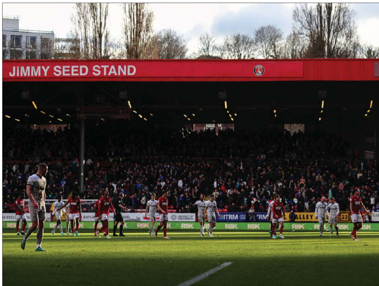
Wycombe fans will traipse to the capital for a lunchtime kick-off between Christmas and New Year.