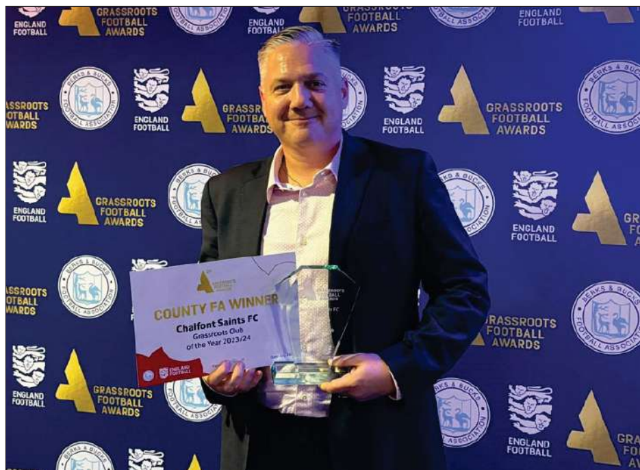
Chalfont Saints were awarded Club of the Year at the county awards