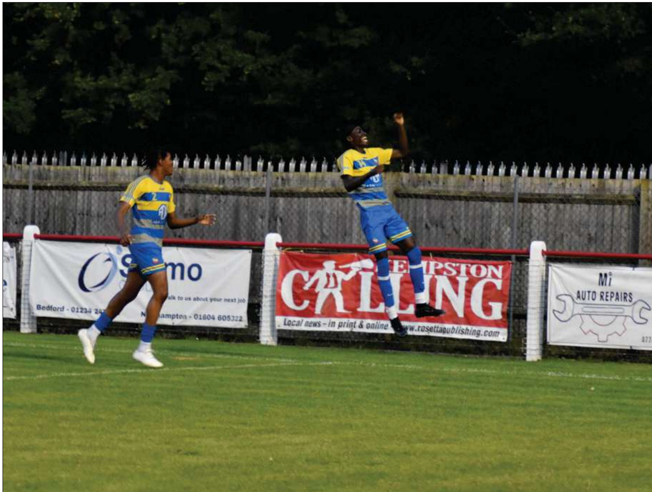
Aylesbury Vale Dynamos returned to winning ways in Bedford after suffering defeat to Arlesey on Saturday