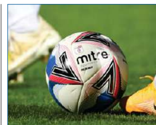
Wanderers lost at home again (PA)