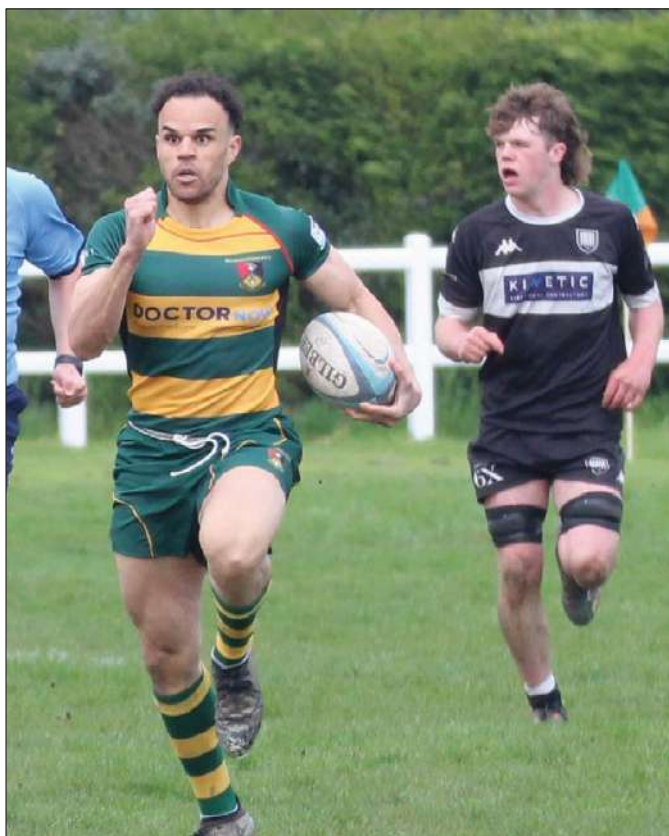
The match took place on April 29 which Beaconsfield won 21-7

BEACONSFIELD Rugby Club will appear in their first-ever Papa John's Community Cup final after they defeated Devizes 21-7 in the semi-finals.