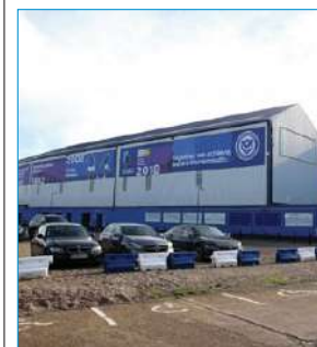
Wycombe go to Pompey

WYCOMBE have one last chance to lay down a marker for next season when they visit Portsmouth for their final game of the 2022/23 campaign on Sunday, May 7.