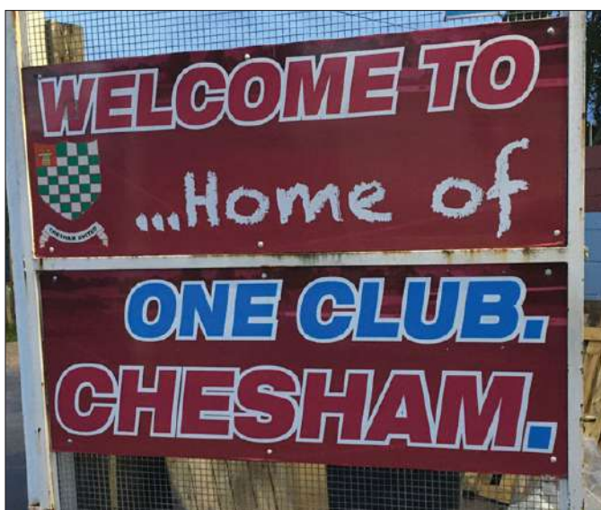
Chesham United play their games at The Meadow within the town, along with Aylesbury United