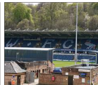
Adams Park (PA)