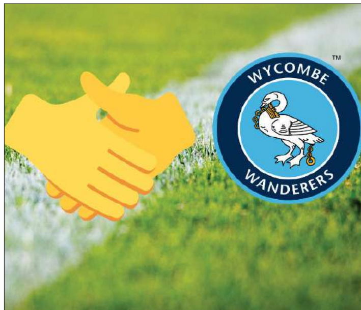
Wycombe will play three pre-season friendlies ahead of the new season