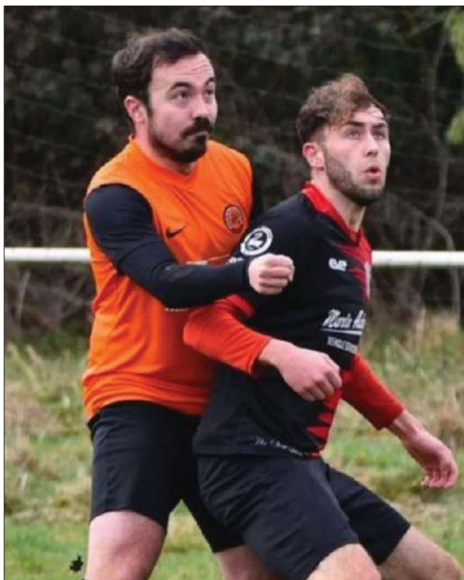
There was a lot going on last Sunday within Bucks Sunday League leagues