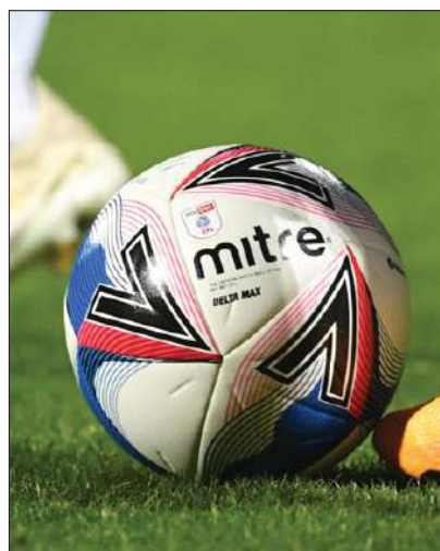
No top six spot this year

Cheltenham's last three visits to Adams Park have produced a staggering twenty-two goals with a couple of 3-3 draws and a crazy 5-5 scoreline last season.....bring it on!