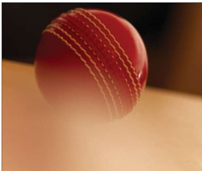
It wasn't Bucks' day last week as they lost to Berkshire

THE 2022/2023 High Wycombe Sunday Football Combination is slowly drawing to a close, as teams across the town fulfil their last batch of fixtures ahead of the upcoming summer break.