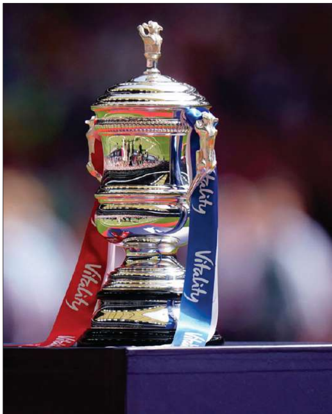
It wasn't Wycombe's day in the Women's FA Cup as they were thumped 8-1 by Dartford

A relentless away bout against Dartford Women saw the Chairgirls crash out of the FA Cup qualifying rounds following an 8-1 defeat.