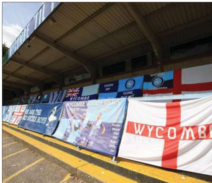
There has never been a 0-0 draw between Wycombe and Peterborough with 16 of the 32 matches having more than three goals scored

"We spoke at Charlton and Portsmouth about playing well but not getting anything, so today's like today showed that we had the character to do that. This group is slowly growing and developing."