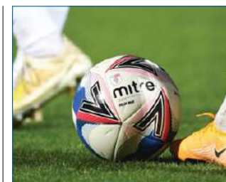
A tough evening at AP