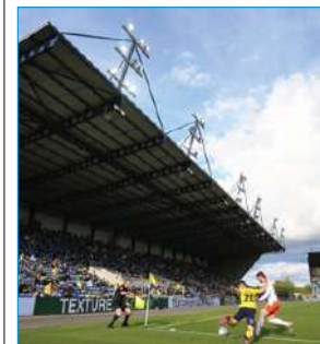
Can Wycombe beat Oxford?