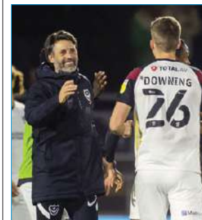
Portsmouth are in town (PA)

THE next few weeks could make or break Wycombe's season as they face five of the leading promotion contenders in League One between now and New Year's Day, beginning with the visit of Portsmouth to Adams Park on Sunday, December 4.