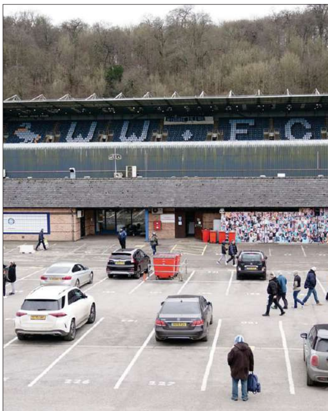
Wycombe's home match against Oxford was due to be played on January 7, 2023, but it will now be moved