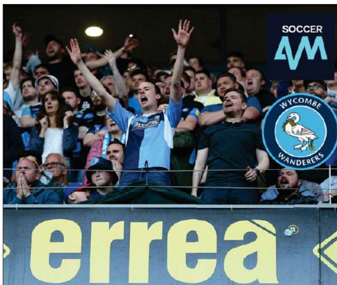
Wycombe Wanderers fans will appear on Soccer AM this Saturday, December 3 - One day before their match against Portsmouth