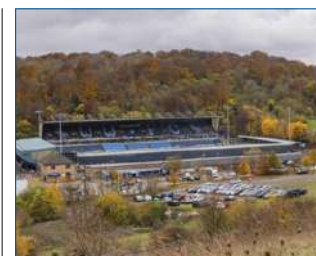
Wanderers' Adams Park