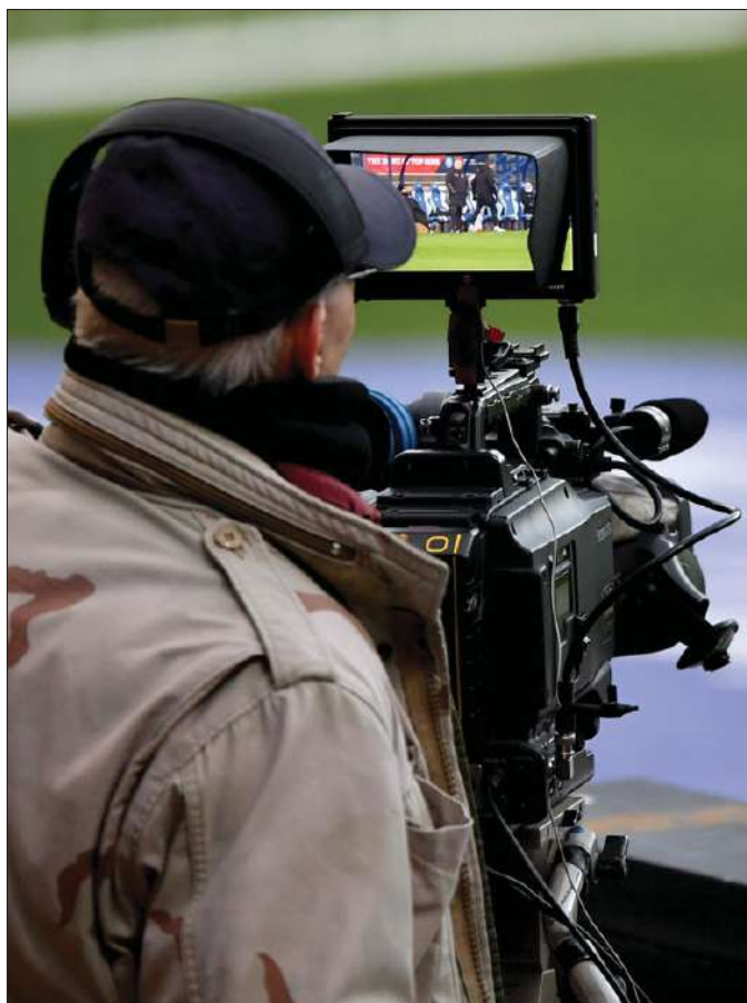
Extra cameras will be on show at Adams Park on December 4

The fixture at Adams Park will kick off at 12.30pm.