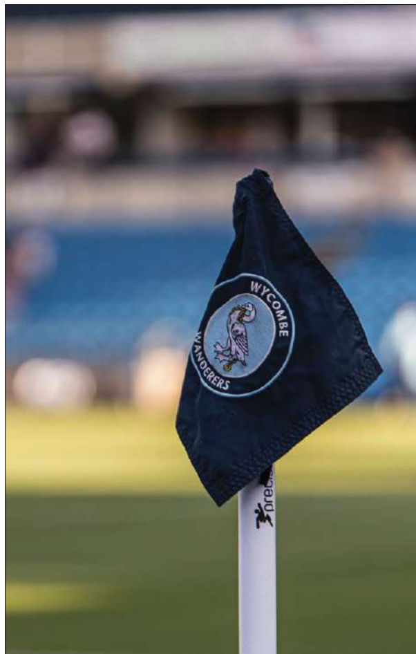
Wanderers have been without an academy since the end of the 2011/12 season

"I plan to change it, because the club intends to give opportunities to our graduates, to be a place for them to open the way to big football."