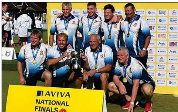
Bowls team made Gerrards Cross history by triple win

The match was a very close affair with Gerrards Cross winning 30-27.