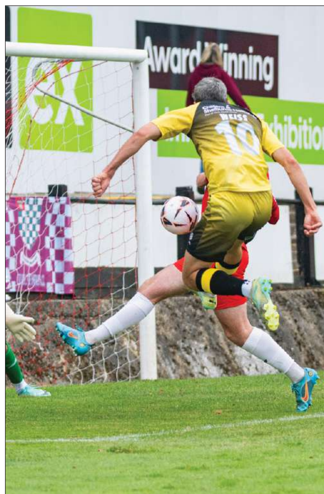
Chesham United were well on top against Welling.

Chesham United FC Women have also started their FA Women's National League campaign. 1 win from 3 and they welcome AFC Sudbury to The Meadow on Sunday (2pm).