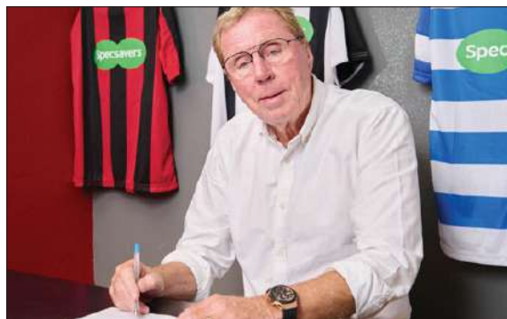
Harry Redknapp was seen the area.

"I've got some fantastic surprises up my sleeve, so let's see who's up for it!"