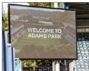
Mansfield at home has been postponed

WYCOMBE Wanderers' home match against Mansfield Town has been postponed due to the international break.