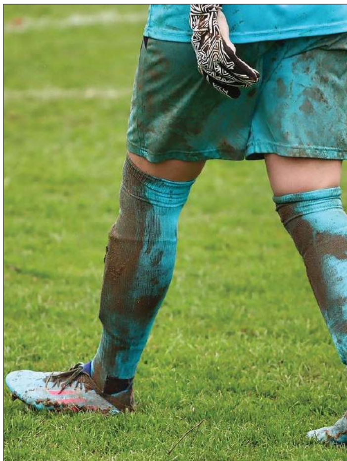
It wasn't Wanderers' day last Sunday

The Chairgirls now set their sights on their upcoming league fixture away to Selsey, on Sunday, September 13, as they look to gain their first points of the 24/25 campaign.