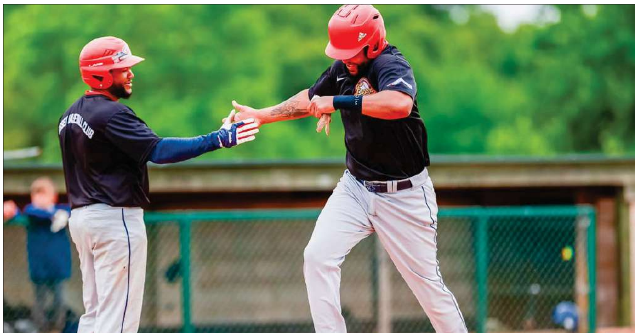
Essex Arrows will take on defending champions London Mets in the BBF National Baseball League final.

T HIS weekend will see the climax of the BBF NBL and BBF AAA 2024 baseball seasons with four teams battling it out at Farnham Park.