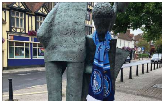
The statue was wearing the scarf (William 'Willie' Reid)

Wycombe's next match is away at Northampton Town on September 14, with the next home fixture being on September 17 against Brighton & Hove Albion U21s in the Bristol Street Motors.