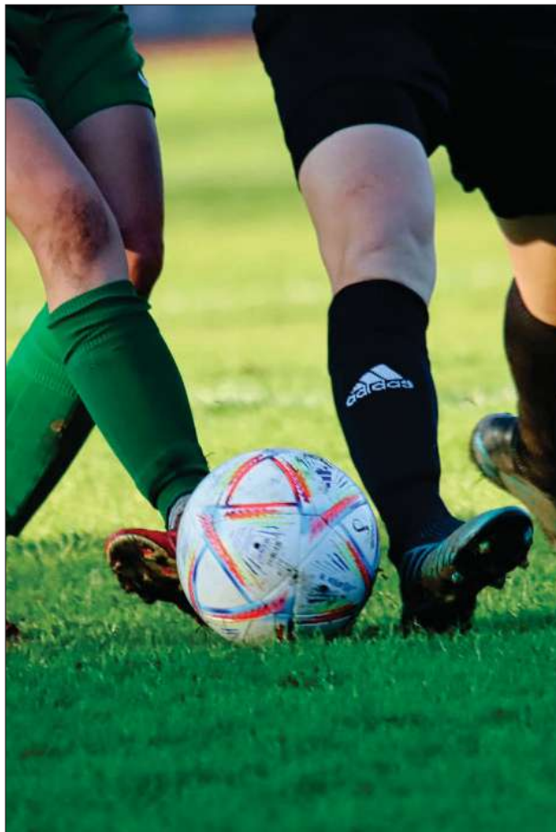
Holmer Green tasted a 3-0 defeat

The Royals have won nine of their 10 matches and sit top of the table.