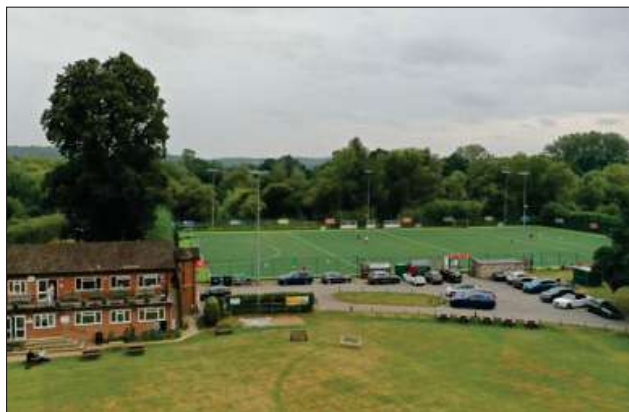
Marlow have had their pitch relayed on Pound Lane