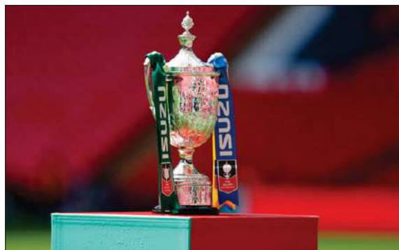
A view of the FA Vase before the Isuzu FA Vase Final.

Next up for Beaconsfield it is back to Southern League Central action, as they welcome Stotfold to Holloways Park.