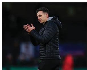
The side have won nine of their 13 league games this season