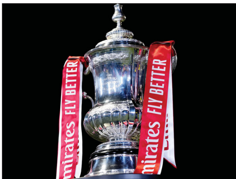
The win over York was Wycombe's first at Adams Park in the FA Cup for nearly four years

It was also their first home victory in the competition since January 2021, when they defeated Preston North End in the third round.