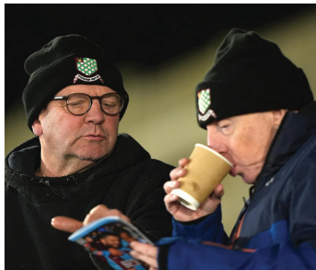
Chesham United fans before the Emirates FA Cup first round match at The Meadow, Chesham