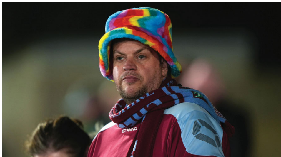
Chesham United fans before the Emirates FA Cup first round match at The Meadow, Chesham.