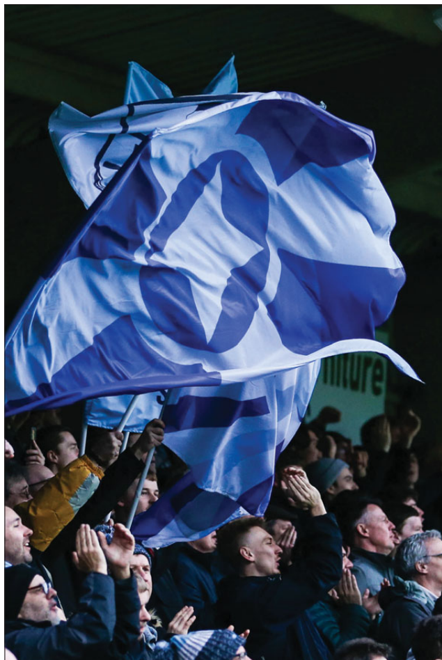
Wycombe are now top of League One following their 5-0 win at Stockport

Up next for Wycombe is Wigan away on Saturday afternoon.