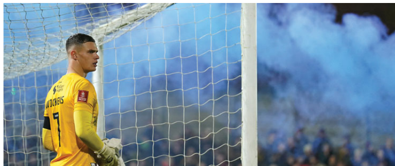
The game was delayed by a few minutes so that the flare was put out. It happened twice during the cup tie on Monday night