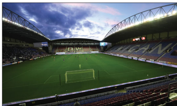
Wycombe have never won away at Wigan