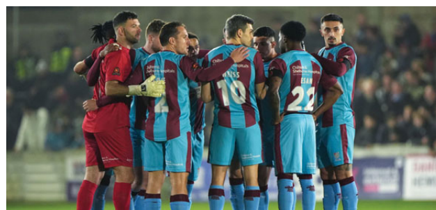
Chesham United players huddle before the Emirates FA Cup first round match at The Meadow