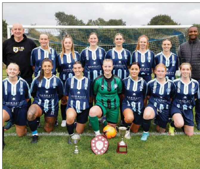
The future looks bright for Buckingham Football Club

WYCOMBE Wanderers Women's first team secured their third win and clean sheet on the bounce following a hard-fought 1-0 home win against Badshot Lea.