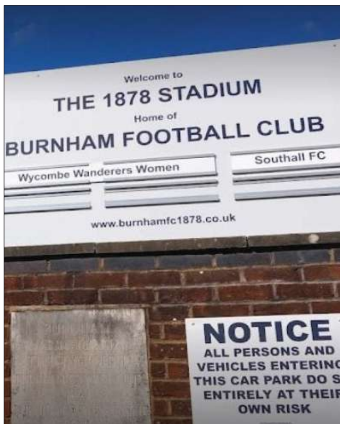
Wycombe Wanderers Women play their games at the 1878 Stadium in Burnham