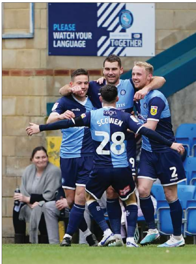
Wycombe have won nine of their 15 games this season

"We have to be pleased every time we do win and it is nice that we are on this good run, so for me, I'm pleased but I'm hungry and desperate for more as I want us to get better."