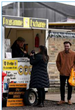
The Abbey Stadium