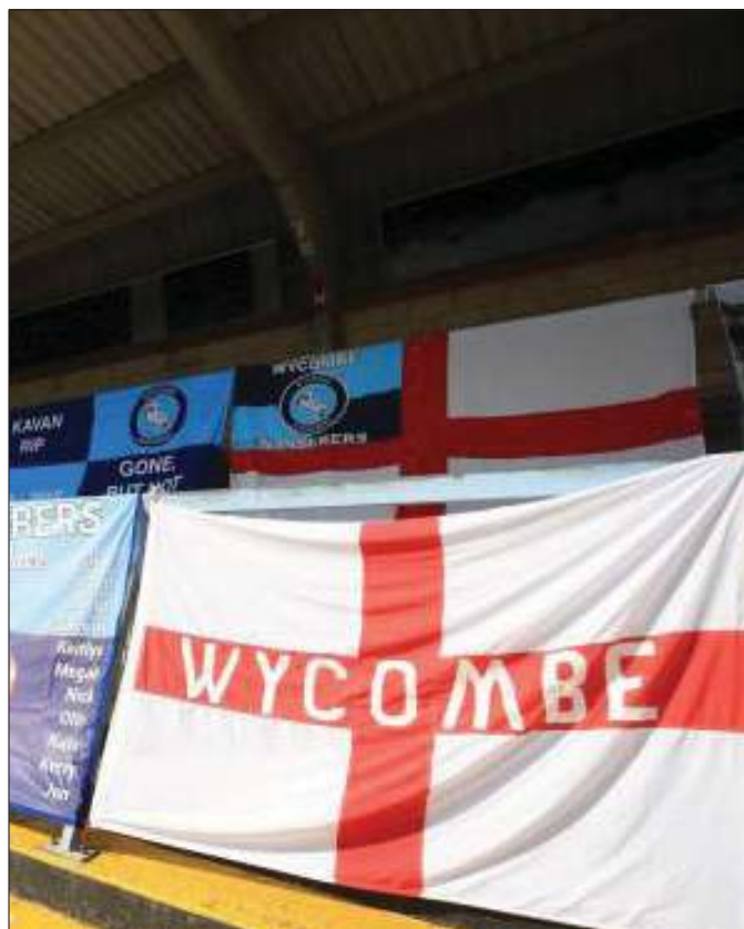
Wycombe lost the cup tie 2-1 to Abingdon last weekend, in which they were eliminated from the Berks & Bucks Cup

WYCOMBE Wanderers' Women's run in the Berks and Bucks Cup came to an end as they lost 2-1 at home to Abingdon.