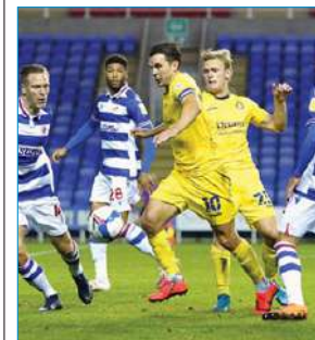
A clash during Covid

WANDERERS return to League One action after a two-week break when they host near neighbours Reading before a near capacity crowd at Adams Park on Saturday, November 25.