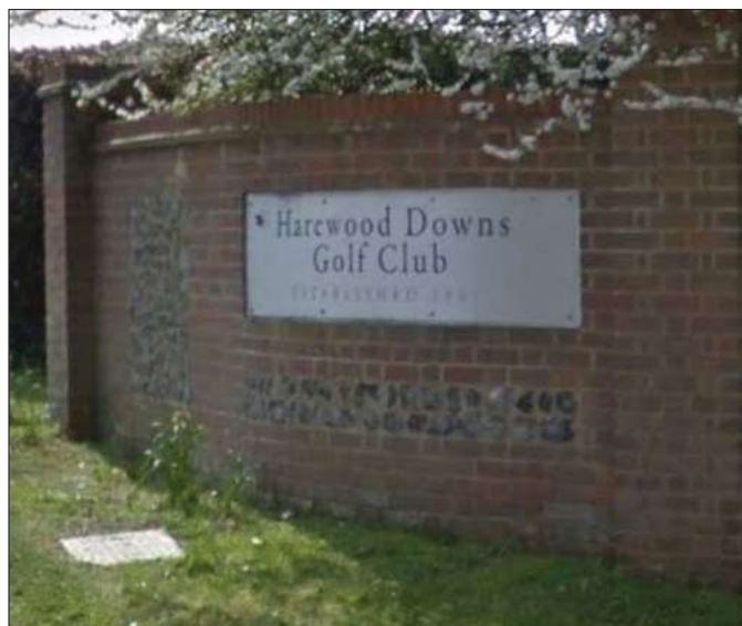
Harewood Downs Golf Club hosted the event last month which raised more than £3,000 for charity