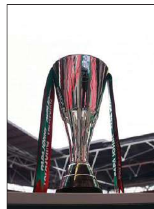
Wycombe are through to the next round in the EFL Trophy