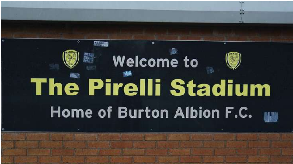
Wycombe hadn't beaten Burton in three games ahead of Tuesday night's clash (PA)