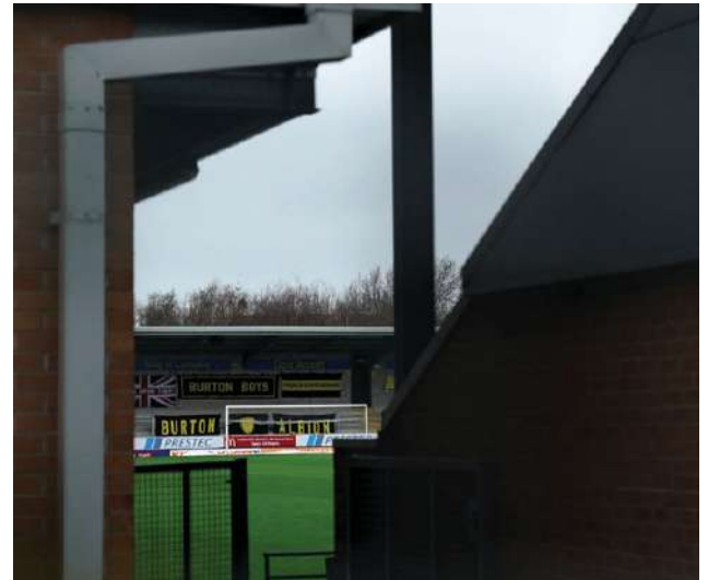
Wycombe's last win at the Pirrelli was on the final day of the 2021/22 season, which Wanderers won 2-1