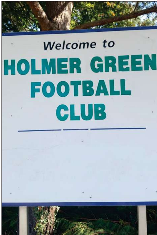
Holmer Green.

Holmer are not a dirty team by any means, but five cautions in one game is unnecessary and too excessive. If Holmer cannot cut this failing out, they will pay for it in suspensions.