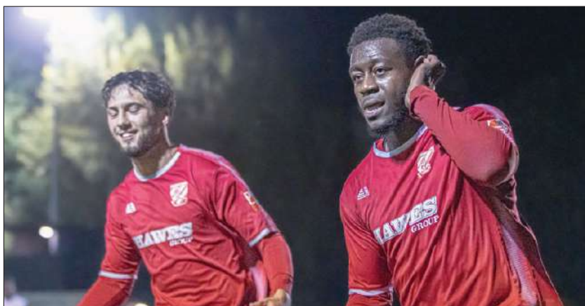
Flackwell Heath celebrate.

Attention now moves to Saturday, as Flackwell look to take this impressive run into a tasty fixture with Real Bedford, who defeated them last season in the FA Vase.