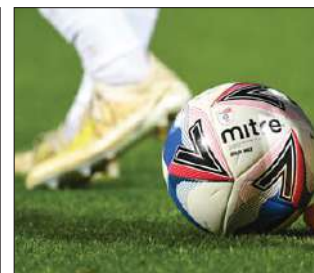
Wanderers lost 1-0

"He's very honest as he tells you the truth behind the situation and I admire that."