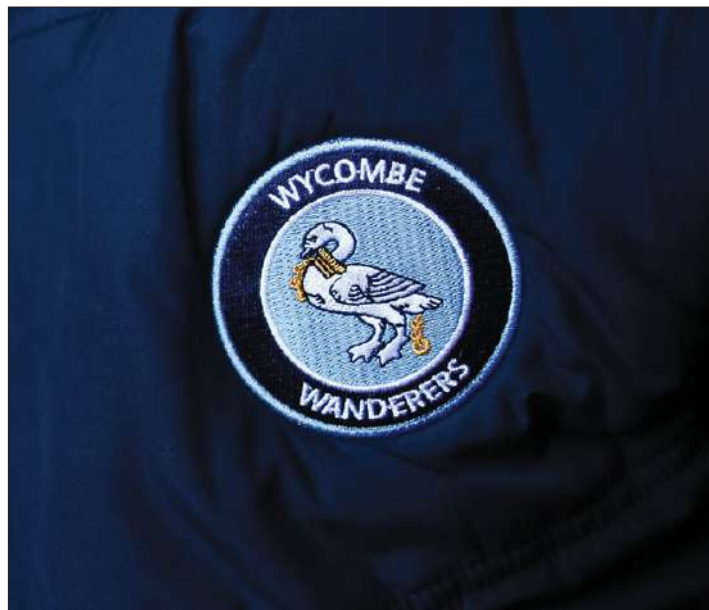
Five Wycombe players will miss the AFC Wimbledon clash on Saturday to play for their respective nations