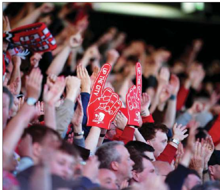
It was nearly a full house at St James Park as Exeter City defeated Wycombe Wanderers 3-1 on August 16

Defensive errors; a hangover from losing the play off final; a failure to recruit enough players in the transfer window; or simply a crippling injury list? Whatever the reason, Wanderers need to find their form and find it quickly.