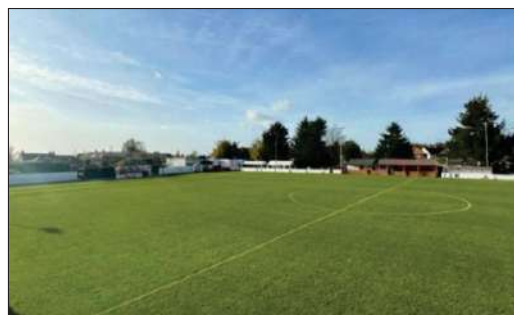
Wilks Park

The first team recently stepped out onto Wilks Park and eased their way into the next round of the FA Cup after beating Keynsham Town