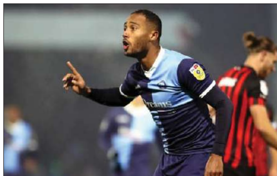
Obita has been Wanderers' good luck charm in 22/23