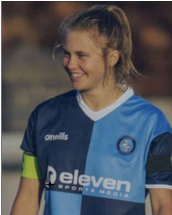
The match between the two sides took place on May 14 with Wycombe being the winners