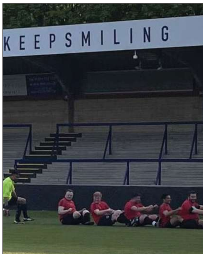
Team One scored the first goal and decided to celebrate in unique fashion. Shame the GK couldn't catch up

IN the space of just two weeks, a 'silly idea on Twitter' initiated by a social media influencer and Wycombe Wanderers fan would help raise more than £700 for several charities.