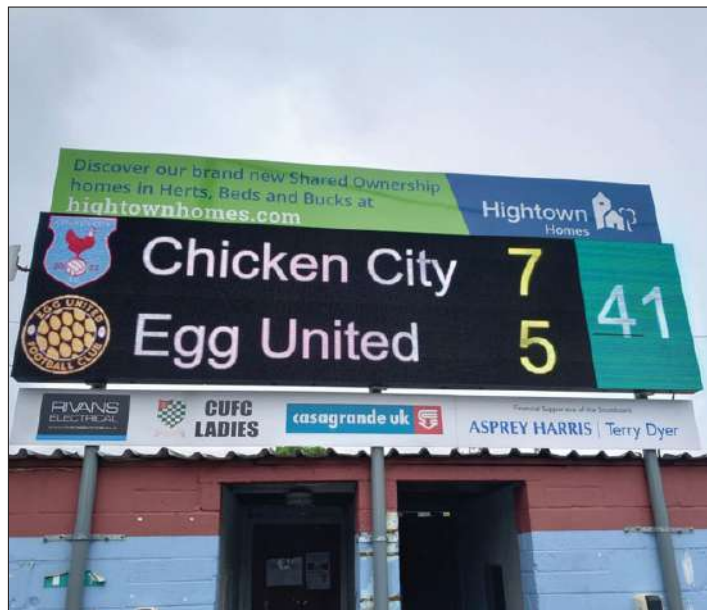
The score at half-time was 7-5 to Chicken City. They would go and win the match 11-9 against Egg United to win the Pineapple Trophy (NQ)

Visit www.cspcc.co.uk for more information.