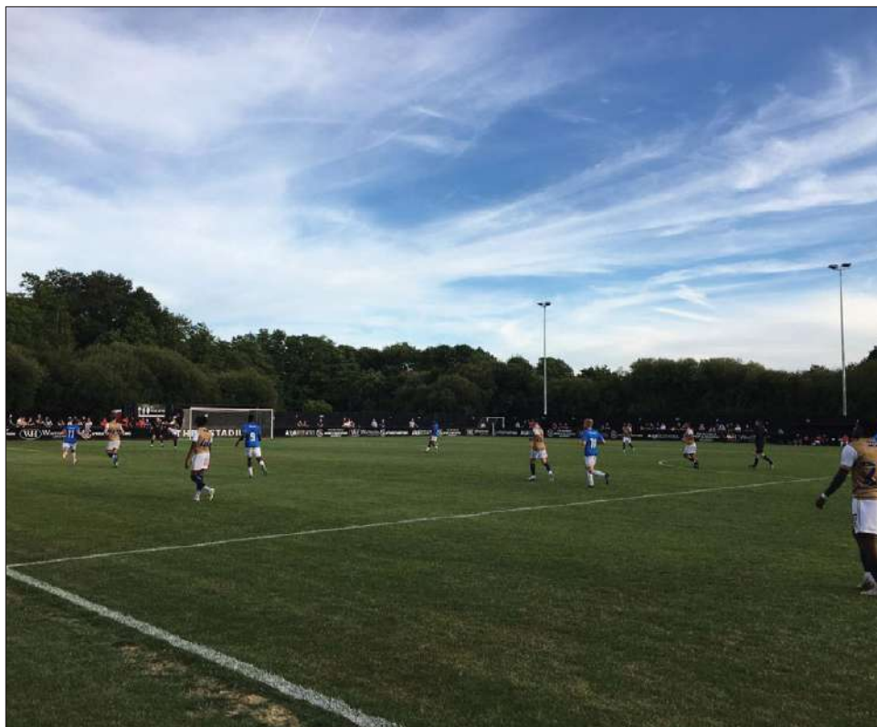
The match took place at the SB Stadium in Sandhurst

likely to break the deadlock in the opening period, while Sam Vokes went close with a header in the closing stages.