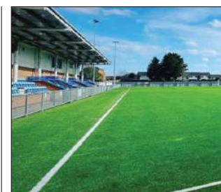
The 1878 Stadium (@