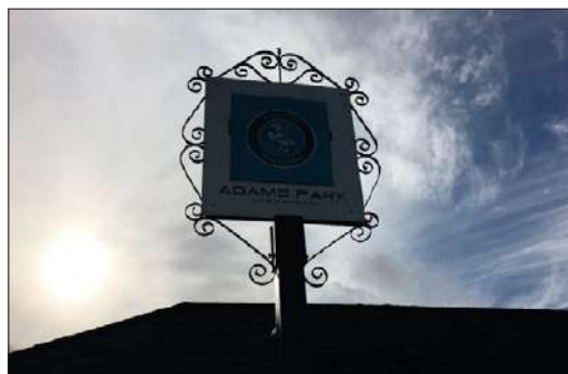
The Chairgirls lost to Bournemouth last weekend