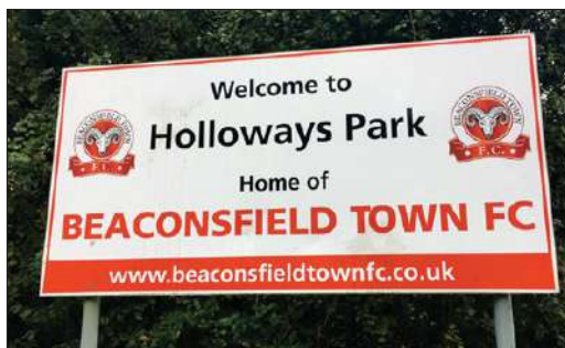
Beaconsfield's win has put the club in the next round

The ties will be played in the week ending November 5.