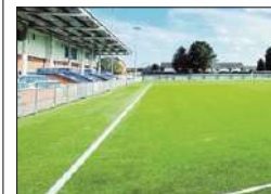
The match took place last weekend in Burnham

WYCOMBE Wanderers Women Under 18s smashed Nottingham Forest 6-0 at Burnham's 1878 Stadium last week.