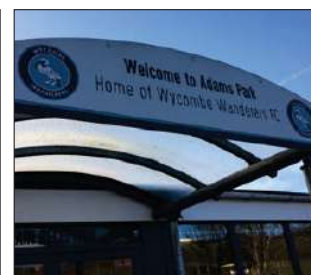
The match took place on Oct 10

"The biggest crowd of the season, just over 10,000, were there to enjoy the game and every fan in the ground behaved with compassion and understanding of the situation."