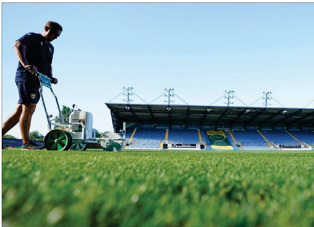
The match between Oxford United and Wycombe Wanderers was stopped after a fan collapsed inside the Kassam Stadium