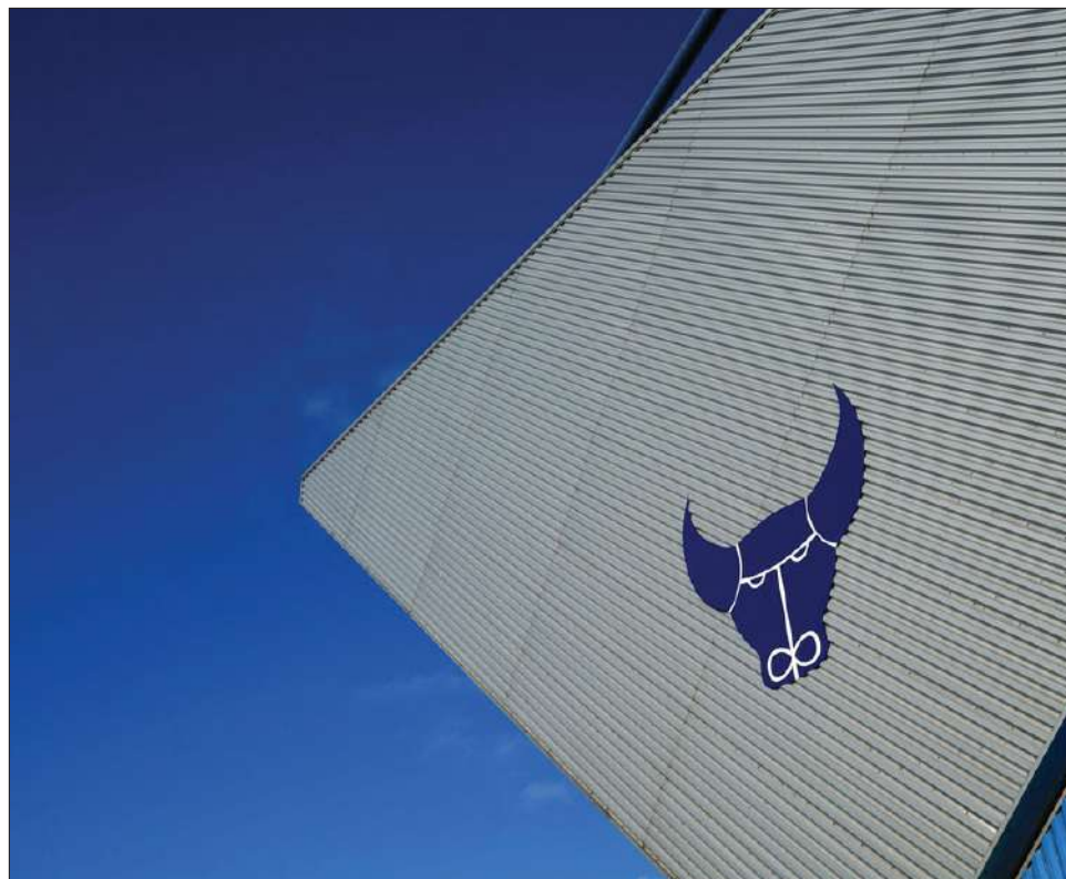
Wycombe's 1-0 win over Oxford United at the Kassam was the club's first at the stadium since November 2014. It also ended a run of three straight league defeats in League One