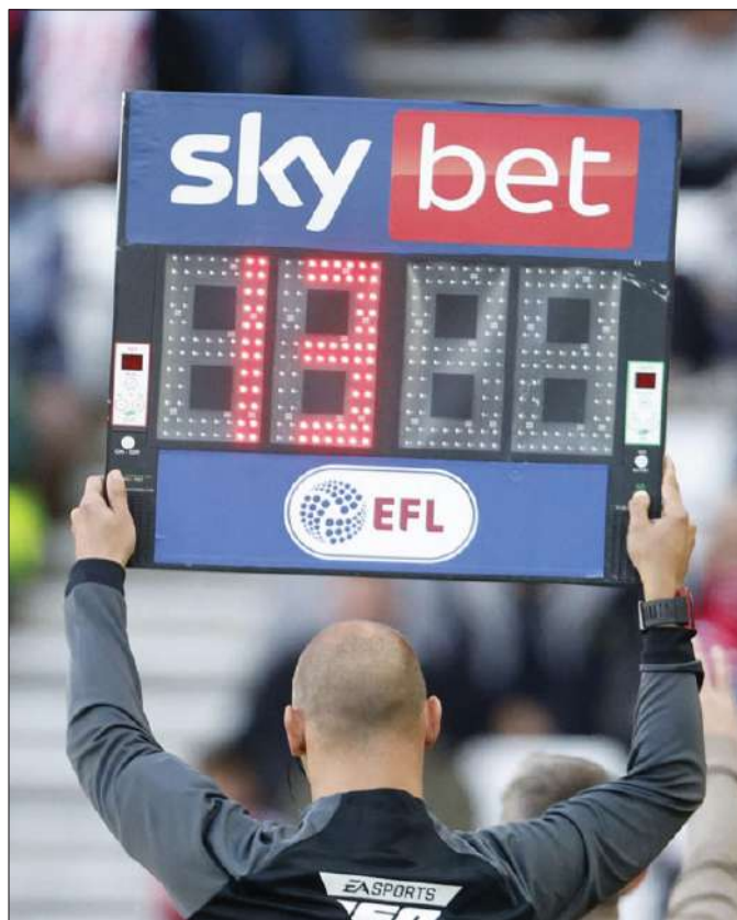
There has been an increase to the amount of minutes being added on at the end of games in the EFL