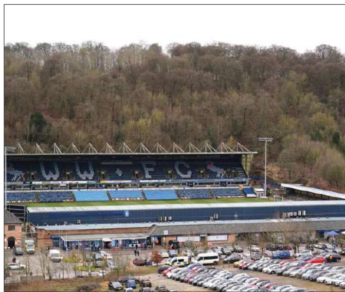
The result means Wycombe remain winless on a Saturday under Matt Bloomfield

ROTATIONS to the Wycombe squad will be a common theme this season due to the increasing length of some fixtures across the football pyramid.