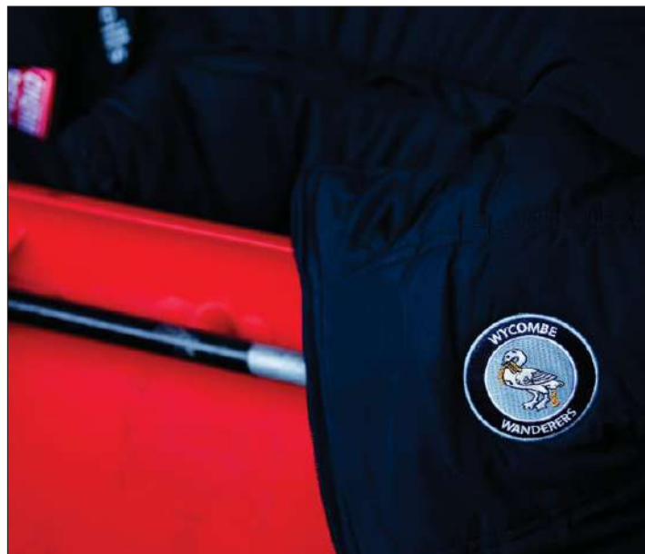
Where will Wycombe finish in 2023/24? This supercomputer believes it'll a top 10 finish