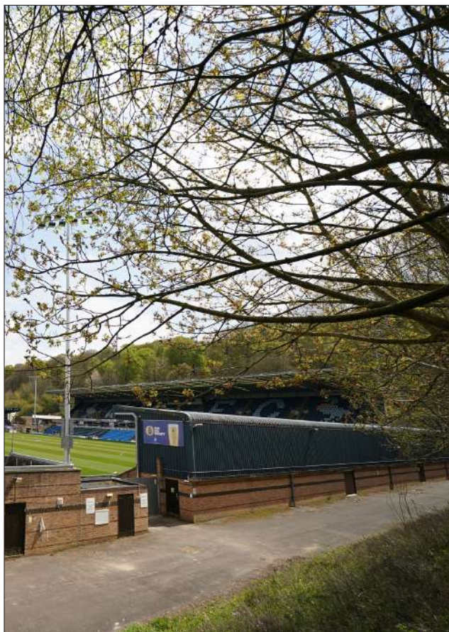
A general view of Adams Park, home to Wycombe Wanderers before the Sky Bet Championship match at Adams Park, Wycombe

A YOUNG Wycombe Wanderers side lost their opening Papa John's Trophy tie to Aston Villa U23s at Adams Park.