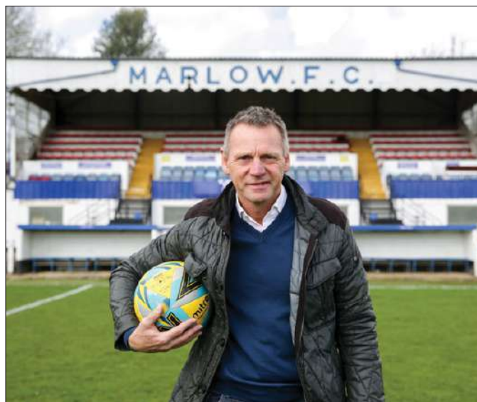
Stuart Pearce attended Marlow FC's ground on March 25 to watch the club in action

To read the full story, go to www.bucksfreepress.co.uk/sport .