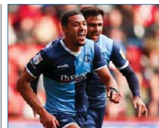
The centre back celebrates