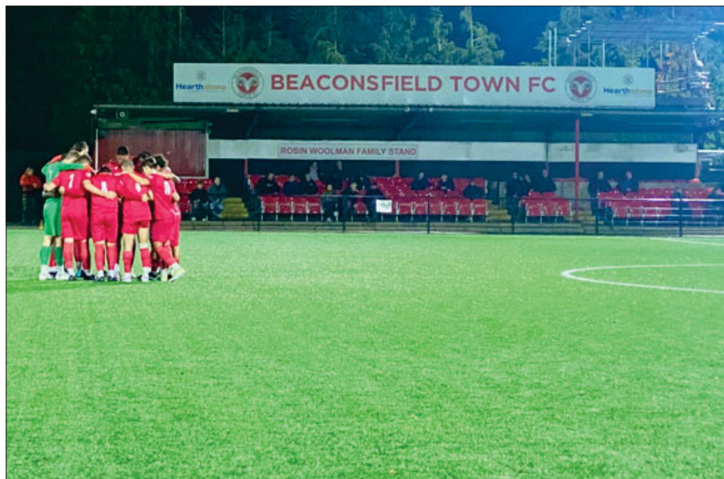
Beaconsfield Town players in a huddle before the match at Holloways Park

On Tuesday night, the Rams emphatically beat Penn and