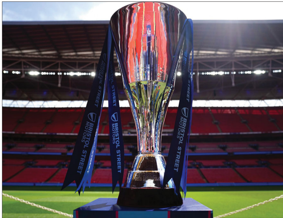
Wycombe defeated Crawley Town in the last group stage game of the EFL Trophy.