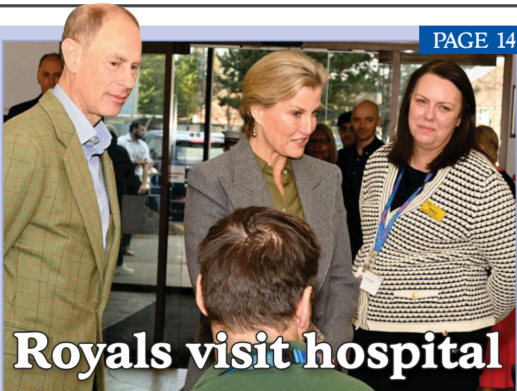
Royals visit hospital