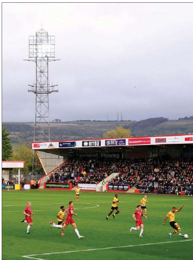
Wanderers loss against Cheltenham was their eighth in League One

Wanderers' next match isn't until December 4 when they take on Portsmouth at Adams Park which is live on Sky Sports.