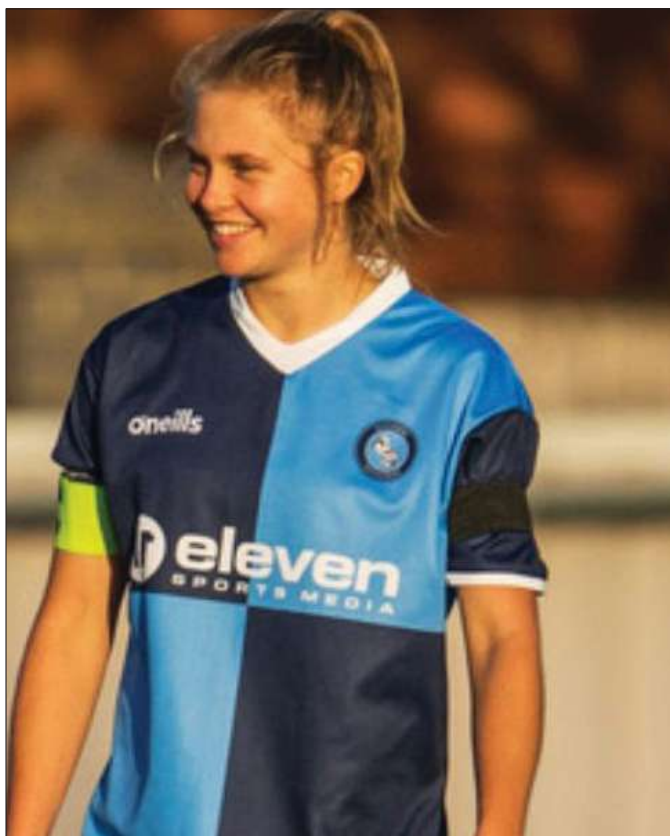
Wycombe Wanderers Women take on Ascot on Sunday, November 27 in Burnham

WYCOMBE Wanderers Women will take on Ascot United Ladies this week as they aim to move away from near the foot of the table.