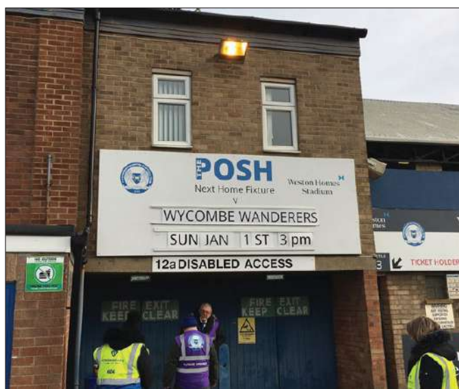
Wycombe have defeated Peterborough twice this season with an aggregate (NQ)

Milham is looking forward to welcoming Newent to Ostler's Field this weekend, with both sides hoping their journey will continue towards Saracens' StoneX Stadium in north London, where the Papa Johns Community Cup concludes for those vying for the South Plate. There is still a lot of rugby to play, with close to 500 grassroots clubs in 24 competitions taking part in the new end-of-season finale.