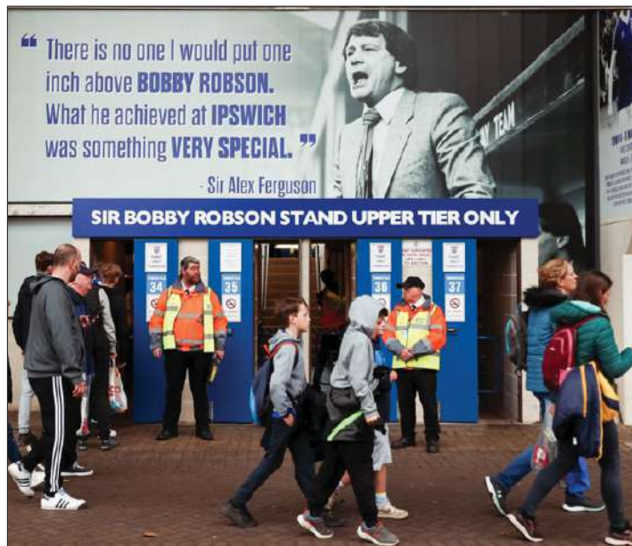
Wycombe have failed to score in their last three visits to Portman Road - losing two of those matches