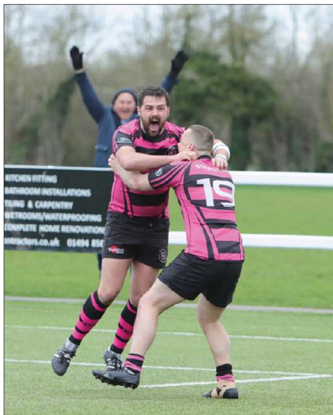
The Papa Johns Community Cup will hopefully be a big hit