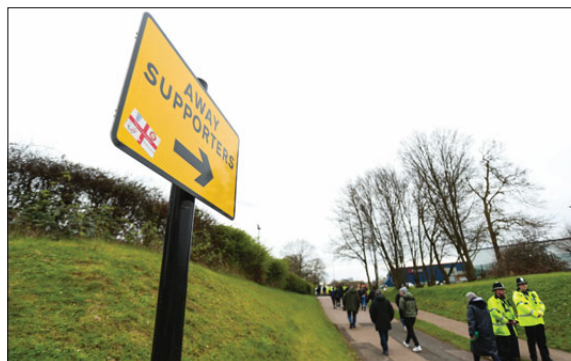
It was Wycombe's first win there in the EFL since 2014