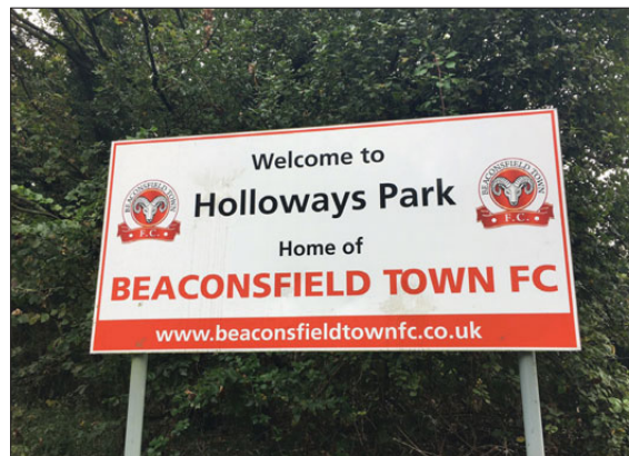
Beaconsfield play their games at Holloways Park

The result means the Rams will end the year in 13th place.