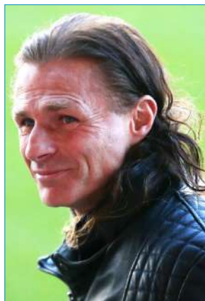
Gareth Ainsworth

WHILST a replay is the last thing both teams wanted, Gareth Ainsworth has stated that he will not disrespect Hartlepool United in the FA Cup.