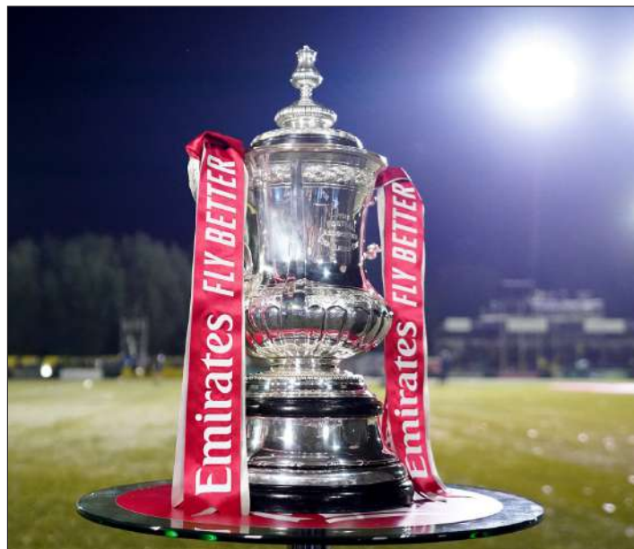
If Wycombe were to defeat Hartlepool United next week, they will travel up to Lincoln for the second round of the competition at the start of December

The defensive player made his debut for Wycombe in the League Cup win over Exeter City in August, before playing in the victory against Stevenage that same month. He also played in the 3-1 loss versus Aston Villa U21 in the EFL Trophy.