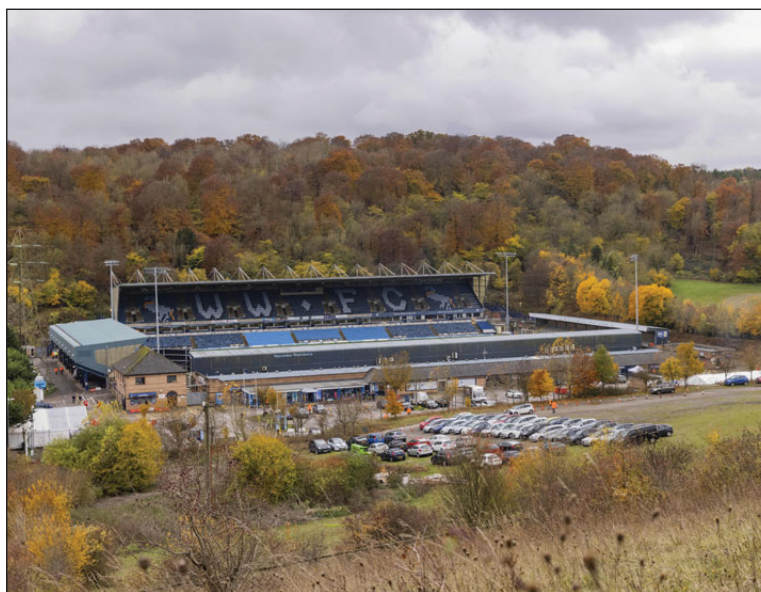
The match will now take place on January 7, 2025 at Adams Park

The draw will be made on November 22, with Wanderers either playing Northampton Town, Swindon Town or Reading in the round of 32.