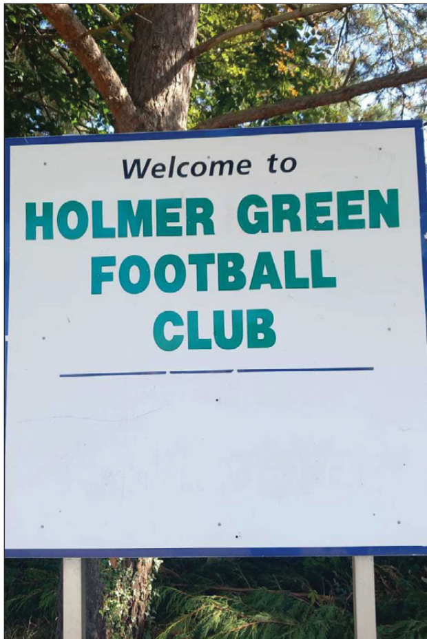
It was an important win for Holmer Green