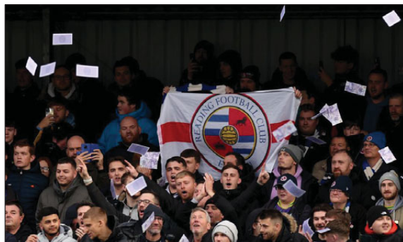
Reading will travel to Wycombe on December 7, with the match kicking off at 3pm

READING have already sold out their ticket allocation for when they face Wycombe Wanderers next month.