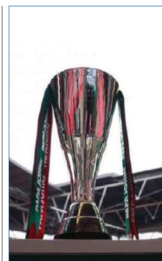
It will begin in Sept