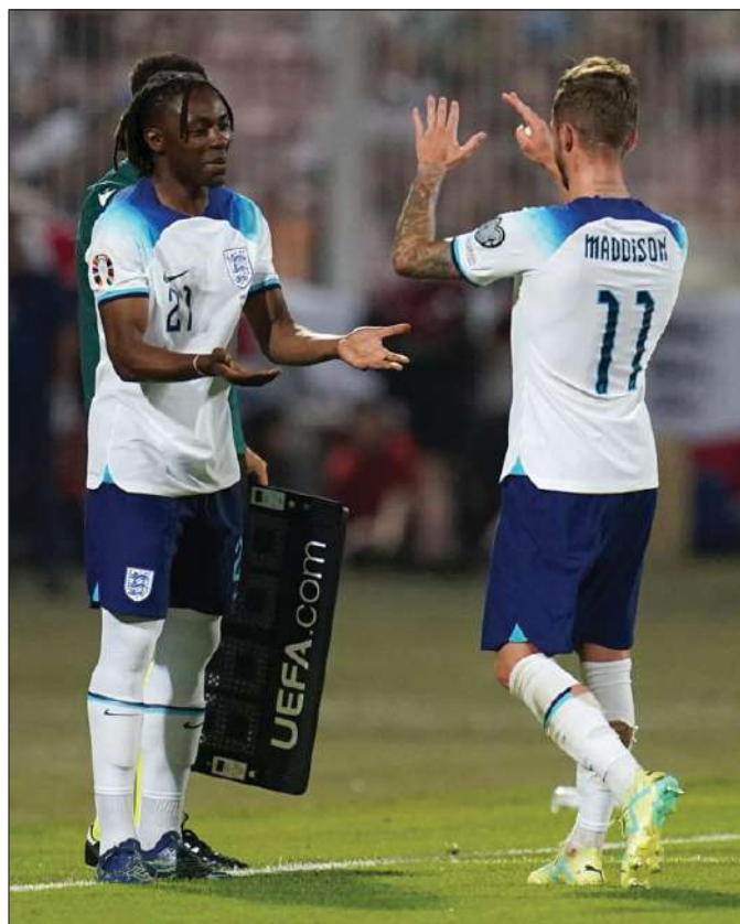
Eberechi Eze (left) replaced James Maddison (right) to make his England debut on Friday, March 16