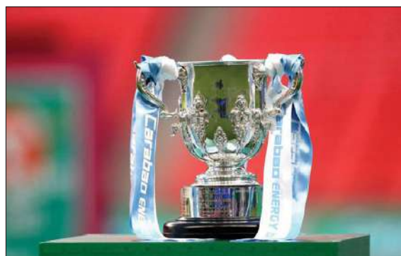
The match will take place on August 8