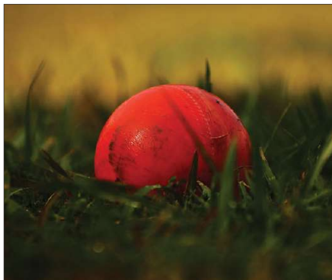
A good weekend for Bucks as they defeated Staffordshire last week

FORMER Wycombe Wanderers winger Eberechi Eze has stated that his England debut 'has been a long time coming' and that he 'thanked God' for the opportunity.