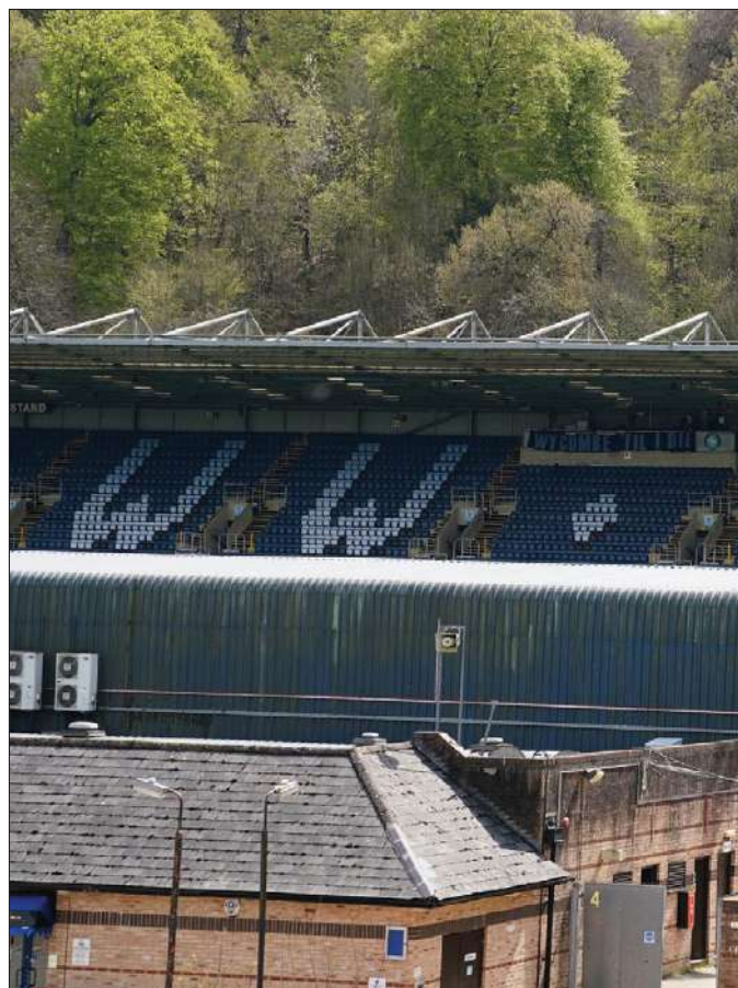
Wycombe will start the new season against Exeter City on August 5 (PA)

April 1: Blackpool (A) April 6: Derby County (H) April 13: Shrewsbury Town (A) April 20: Carlisle United (A) April 27: Charlton Athletic (H)