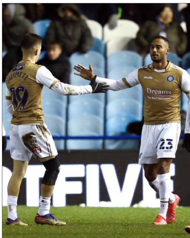
Wycombe drew 2-2 away at Sheffield Wednesday on November 27 - their last game for 10 days before they defeated Burton at home 2-1

WANDERERS have historically struggled for results over the festive period, and with the top of League One being so competitive, they may not be able to afford the same this year.