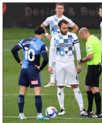
The iconic number 10 shirt (PA)