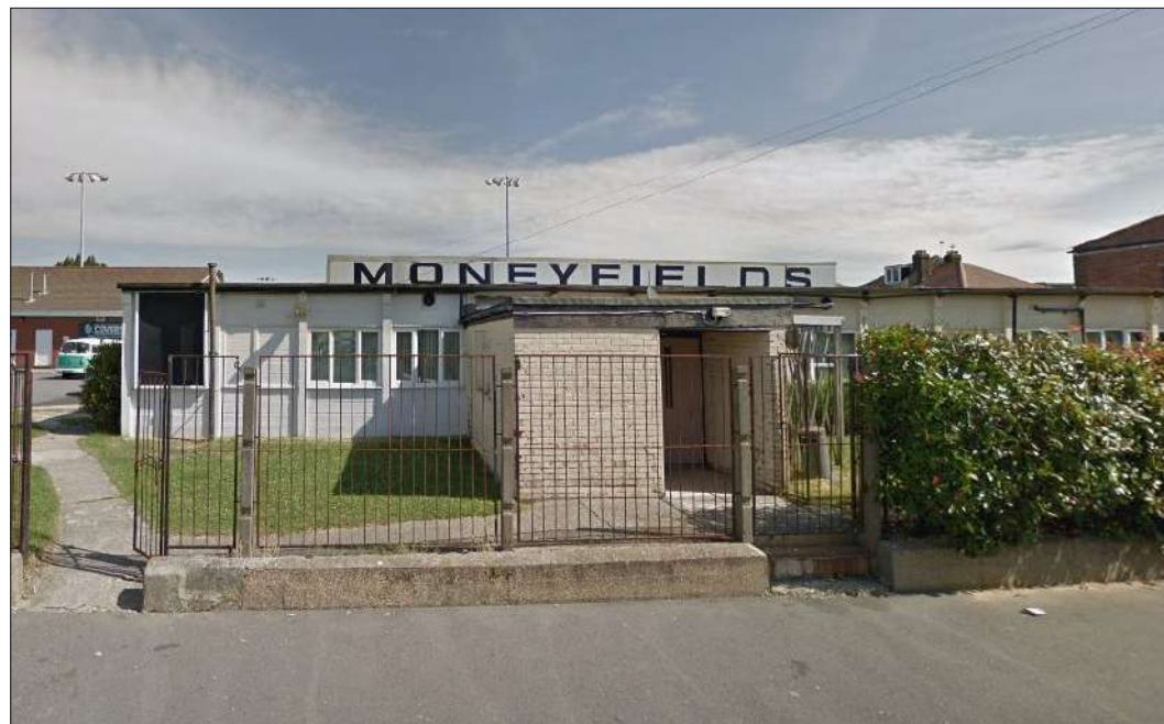
The Chairgirls faced Moneyfields on the south coast last weekend and lost 7-0 (Pictured in July 2017)