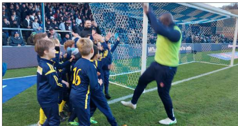
Moments that last a lifetime (WWSET)