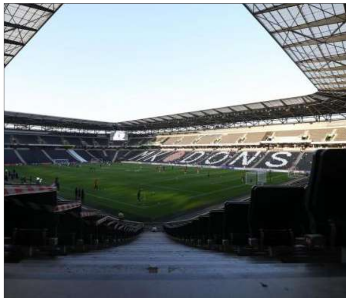
The away side released a statement not long after the match finished which saw them win 1-0. They play their home games at Stadium: MK (PA)