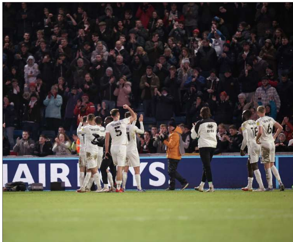
Milton Keynes' players celebrate their win with their fans following the 1-0 win over Wycombe on January 29. It was the third time this season that the team from North Bucks had defeated Wanderers this season

Urgency was needed from the Chairboys in the second-half if they were going to lift a subdued Adams Park crowd.