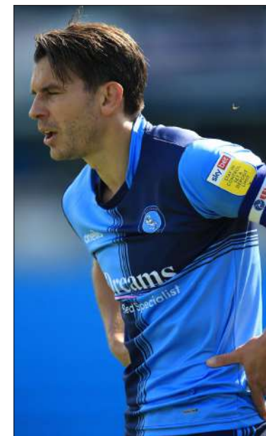
Enjoy your new chapter, Blooms (PA)