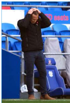
Gareth Ainsworth

WYCOMBE Wanderers manager Gareth Ainsworth has revealed his thoughts following his side's 1-0 home loss to MK Dons on January 29.