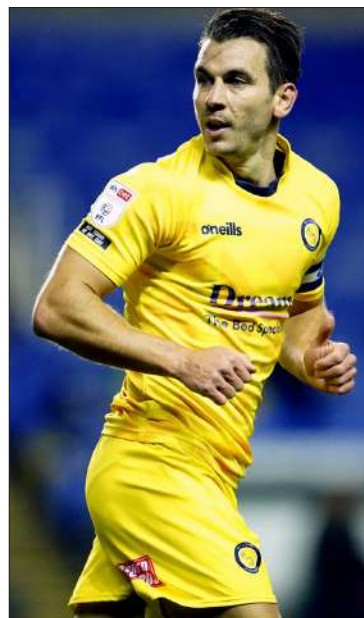
The skipper in action