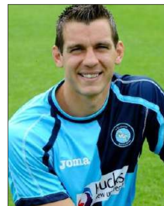
Blooms in the 2009-11 home kit