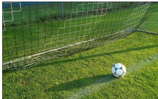
It wasn't the best of days for Wanderers

Next up for the Chairgirls is a home match against Ascot United on Sunday, February 13 which will kick-off at 2pm.