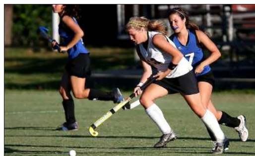
How did Marlow do last week?

The fifth team beat Newbury and Thatcham 3-1 away, the sixth team beat Wycombe 2-1 and the seventh team beat Wycombe6 3-0