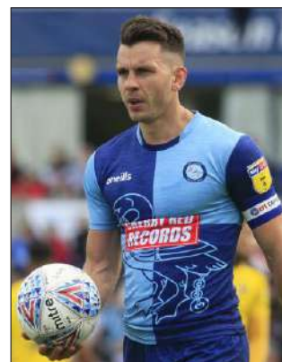
Wanderers' captain