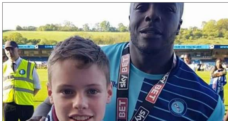
A day to remember for this young supporter: Promotion for Wanderers and a pic with a legend in May 2018