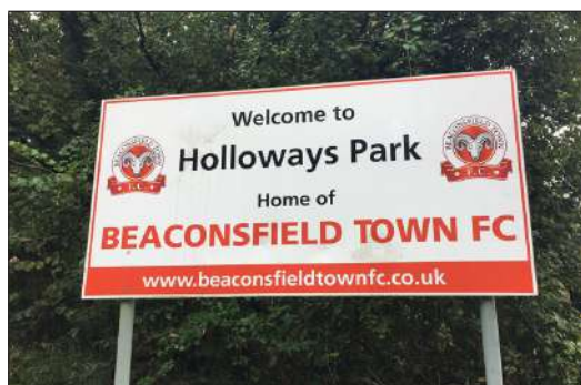
Beaconsfield Town FC play their games at Holloways Park