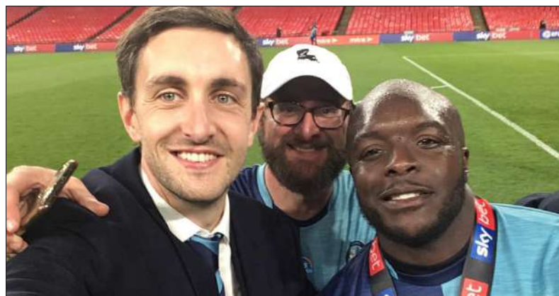
The aftermath from THAT day at Wembley (Matt Cecil)