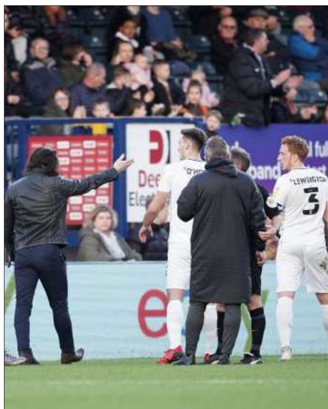
Wycombe boss Gareth Ainsworth asked the MK fans to stop singing the slanderous chant at Adebayo Akinfenwa on Saturday, January 29

THE EFL has issued a statement in the face of the growing amount of 'unacceptable' anti-social behaviour in games across the country.